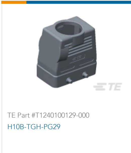
TE Part #T1240100129-000 H10B-TGH-PG29