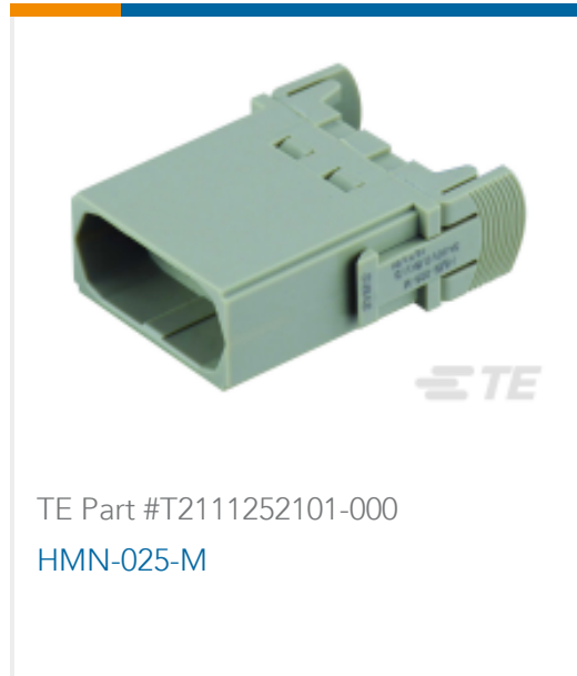
TE Part #T2111252101-000 HMN-025-M