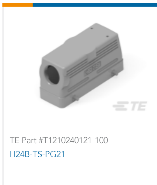
TE Part #T1210240121-100 H24B-TS-PG21