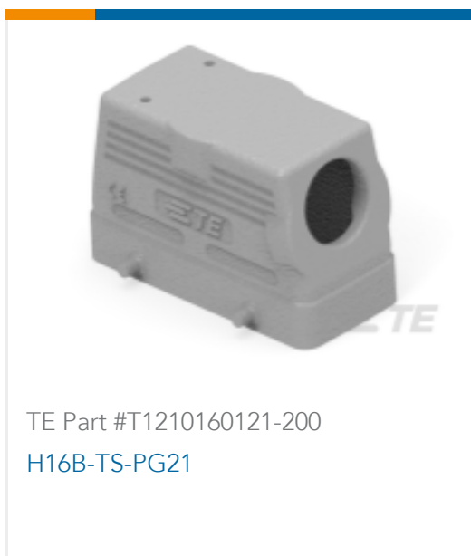
TE Part #T1210160121-200 H16B-TS-PG21