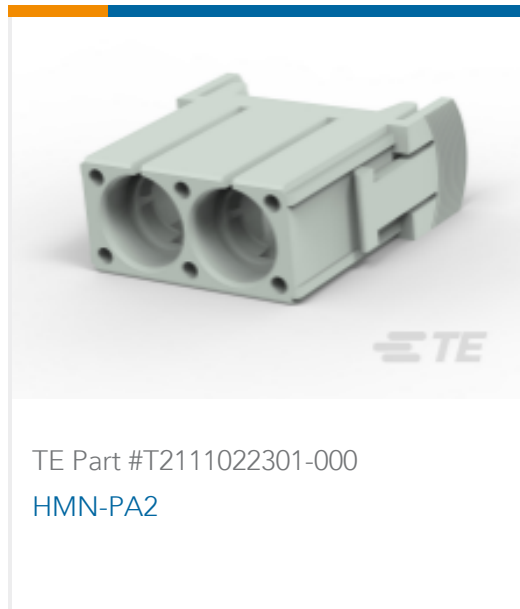
TE Part #T2111022301-000 HMN-PA2