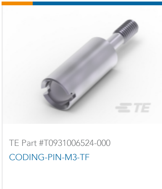
TE Part #T0931006524-000 CODING-PIN-M3-TF