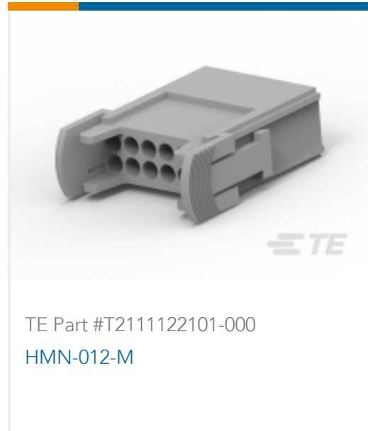
TE Part #T2111222101-000 HMN-012-M