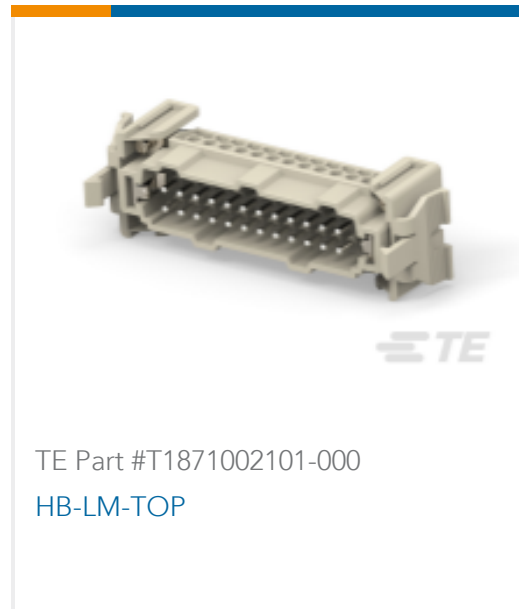
TE Part #T1871002101-000 HB-LM-TOP