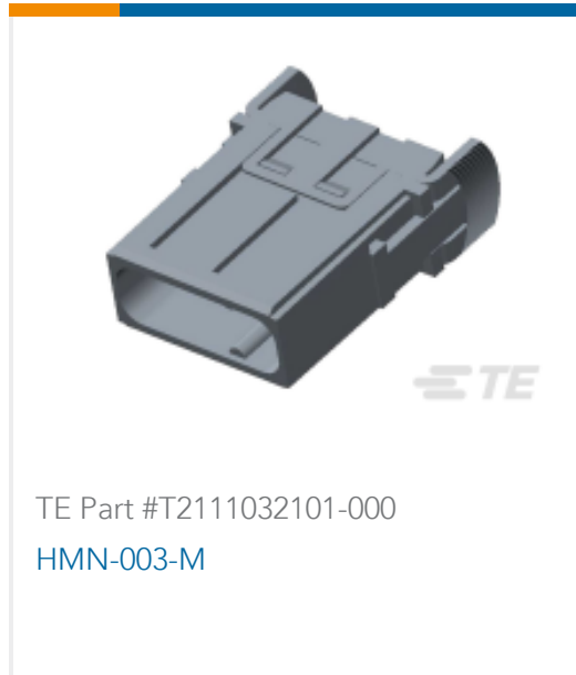
TE Part #T2111032101-000 HMN-003-M