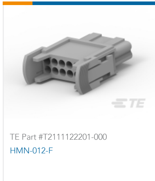
TE Part #T211122201-000 HMN-012-F