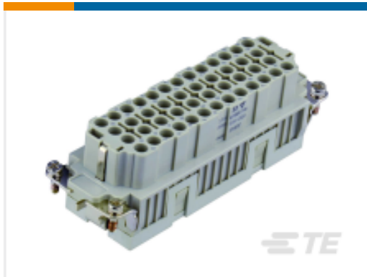
TE Part #T2050462201-000 HEE-046-F