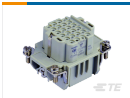
TE Part #T2030243201-000 HDD-024-FJ