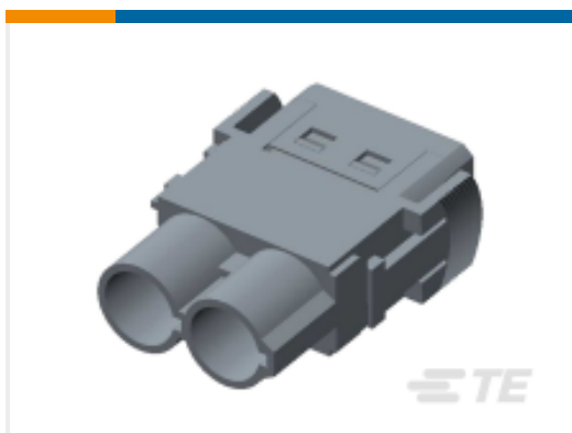
TE Part #T2111020101-000 HMN-002-MC