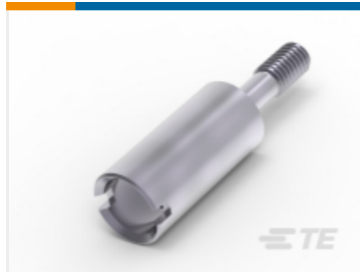
TE Part #T0931006524-000 CODING-PIN-M3-TF