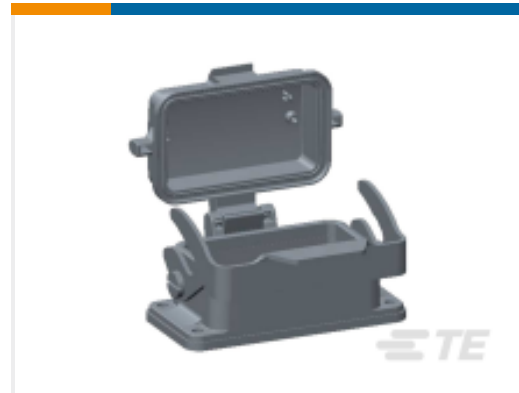
TE Part #T1510103000-000 H10B-AD-LB