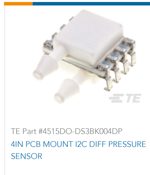
TE Part #4515DO-DS3BK004DP 4IN PCB MOUNT I2C DIFF PRESSURE SENSOR