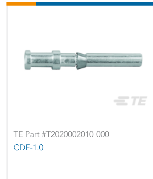
TE Part #T2020002010-000 CDF-1.0