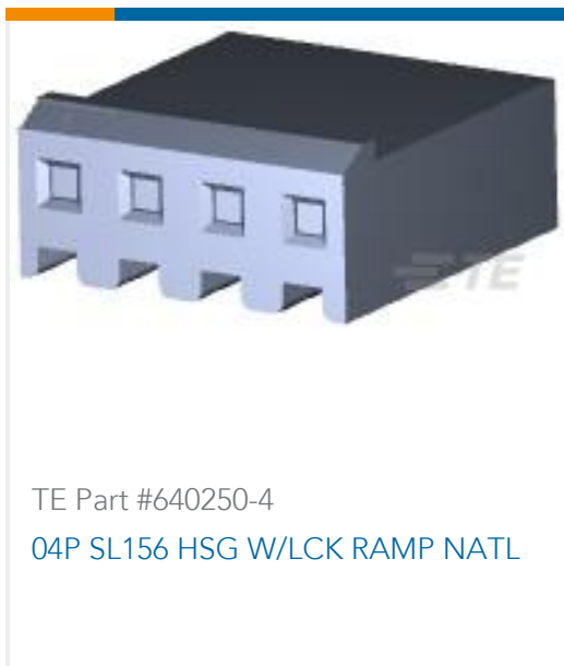
TE Part #640250-4 04P SL156 HSG W/LCK RAMP NATL