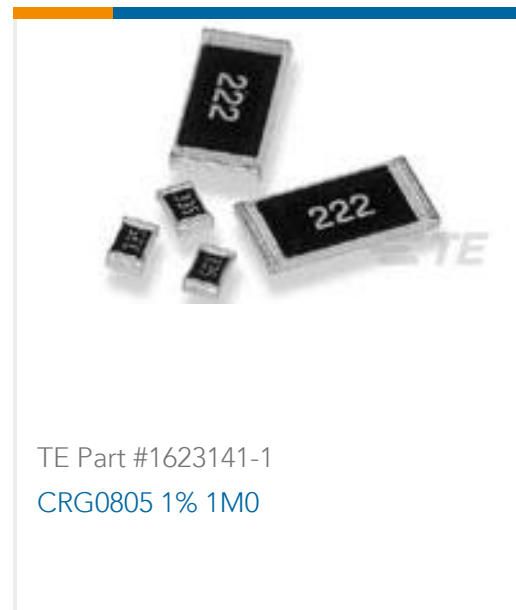
TE Part #1623141-1 CRG0805 1% 1M0