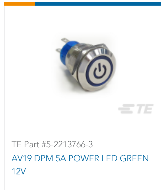
TE Part #5-2213766-3 AV19 DPM 5A POWER LED GREEN 12V