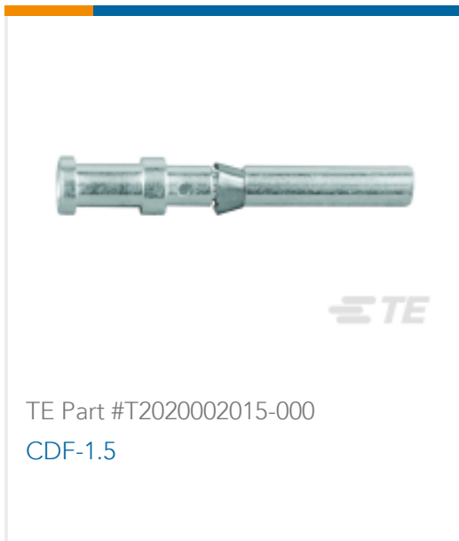
TE Part #T2020002015-000 CDF-1.5