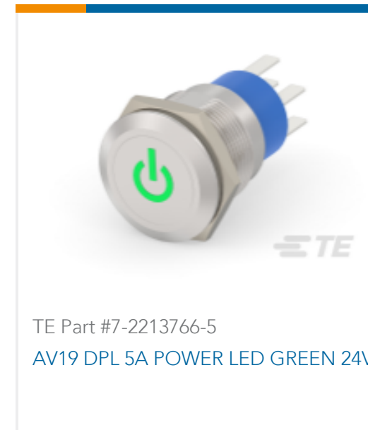
TE Part #7-2213766-5 AV19 DPL 5A POWER LED GREEN 24V