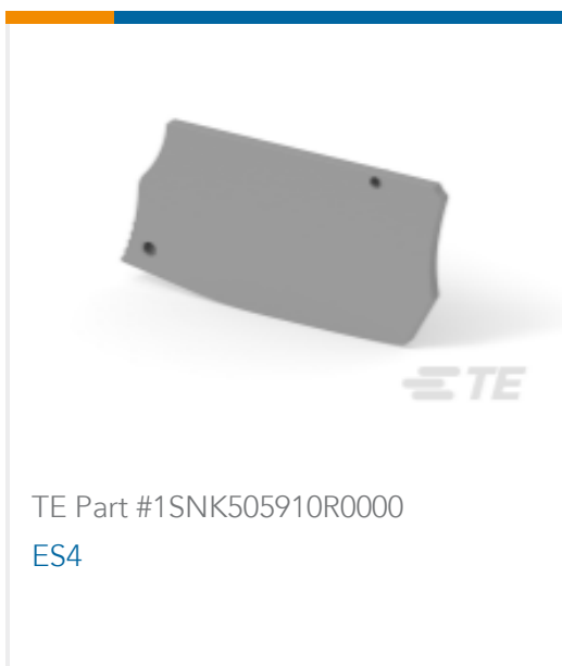
TE Part #1SNK505910R0000 ES4