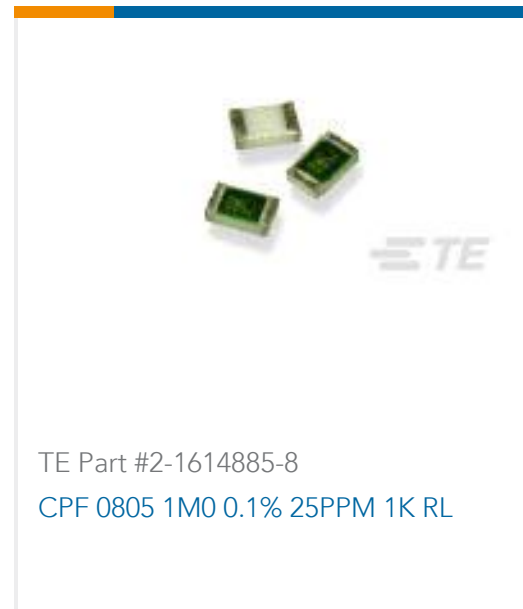
TE Part #2-1614885-8 CPF 0805 1M0 0.1% 25PPM 1K RL