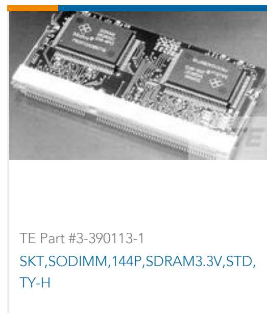
TE Part #3-390113-1 SKT,SODIMM,144P,SDRAM3.3V,STD, TY-H