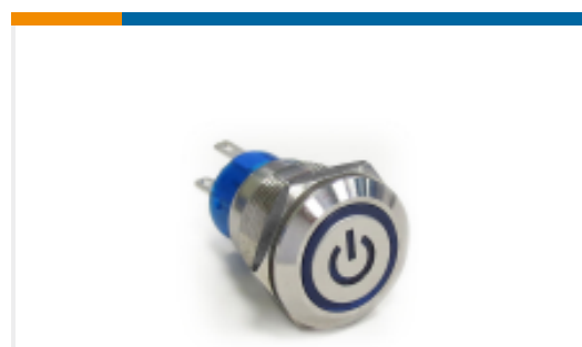
TE Part #5-2213766-3 AV19 DPM 5A POWER LED GREEN 12V