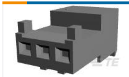
TE Part #3-643814-3 03P MTA100 CONN ASSY POL RIB