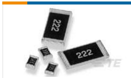
TE Part #1623141-1 CRG0805 1% 1M0