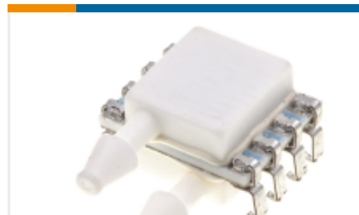
TE Part #4515DO-DS3BK004DP 4IN PCB MOUNT I2C DIFF PRESSURE SENSOR