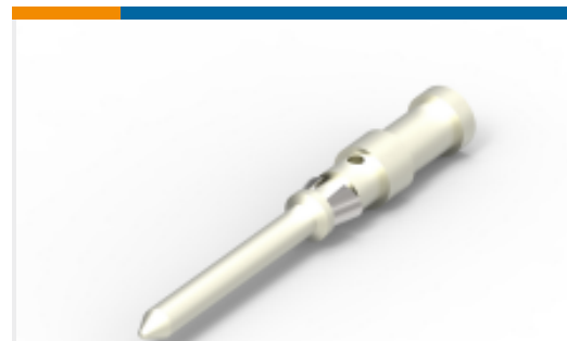
TE Part #T2020001010-000 CDM-1.0