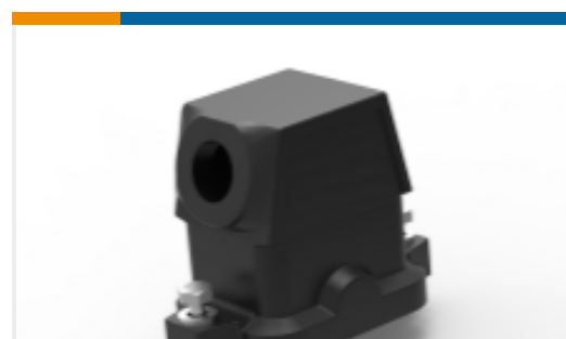
TE Part #T1912060120-009 H6BPR-TSHC-M20-EMC-C