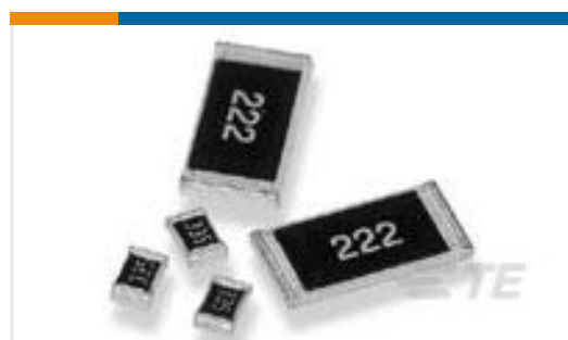
TE Part #1623171-1 CRG0805 1% 27R