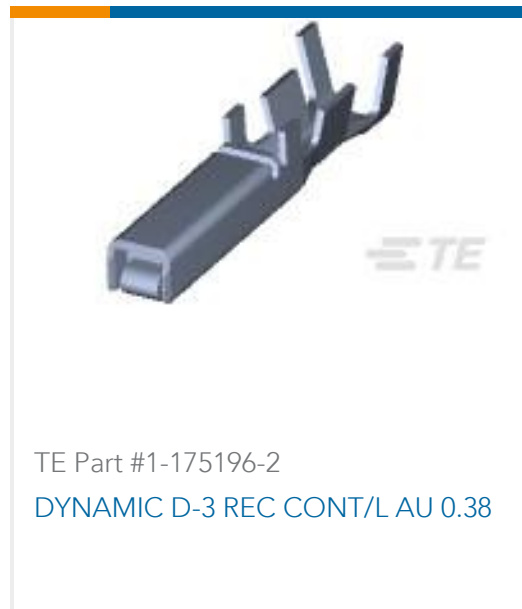
TE Part #1-175196-2 DYNAMIC D-3 REC CONT/L AU 0.38