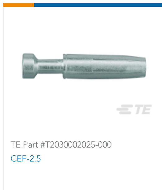
TE Part #T2030002025-000 CEF-2.5