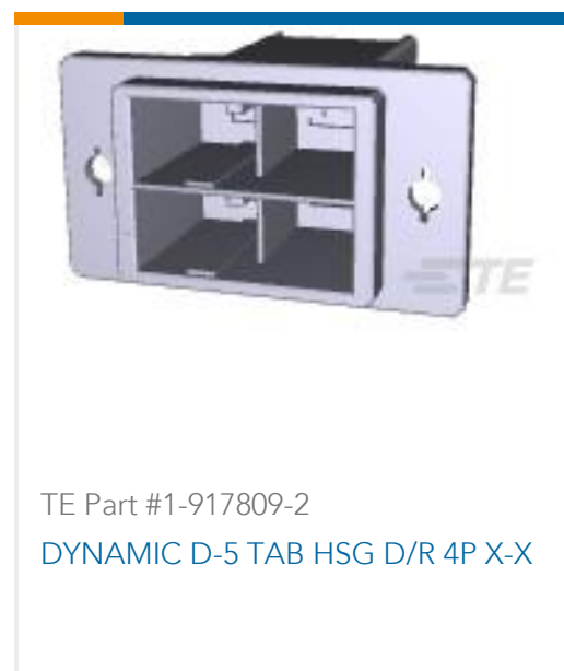
TE Part #1-917809-2 DYNAMIC D-5 TAB HSG D/R 4P X-X