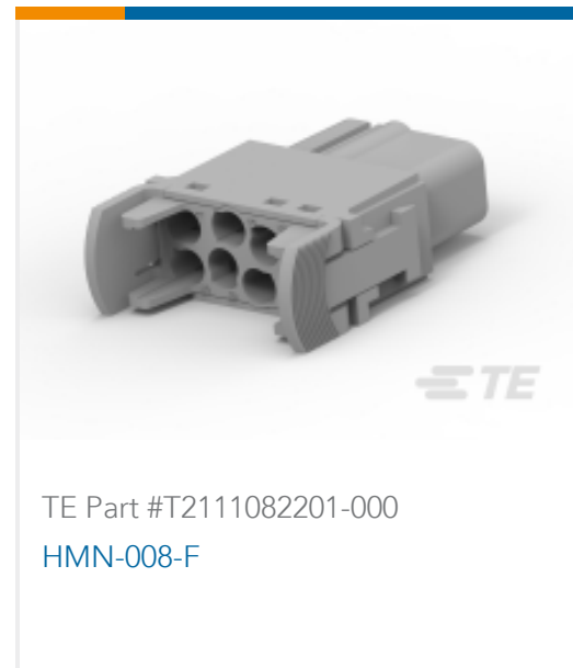
TE Part #T2111082201-000 HMN-008-F