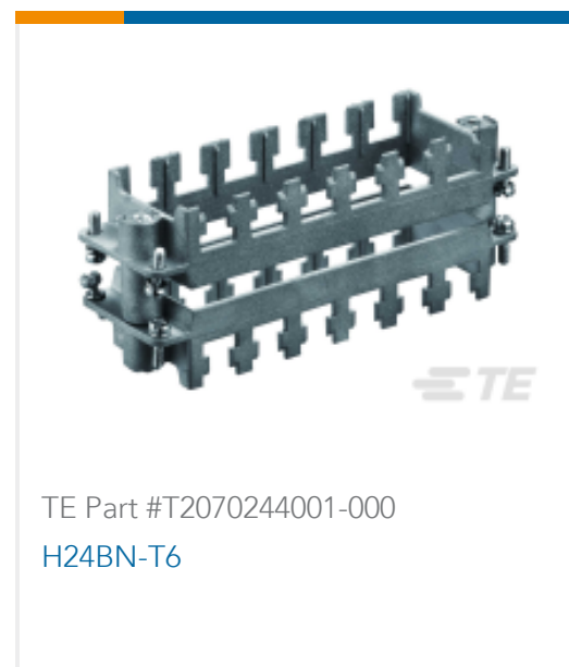
TE Part #T2070244001-000 H24BN-T6