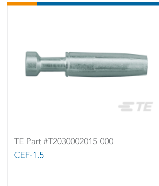
TE Part #T2030002015-000 CEF-1.5