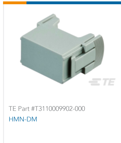
TE Part #T3110009902-000 HMN-DM