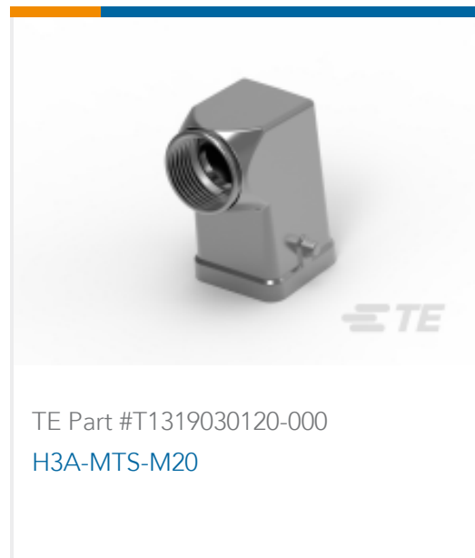
TE Part #T1319030120-000 H3A-MTS-M20