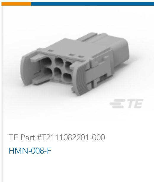
TE Part #T2111082201-000 HMN-008-F