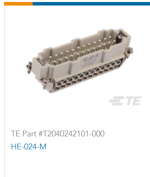
TE Part #T2040242101-000 HE-024-M