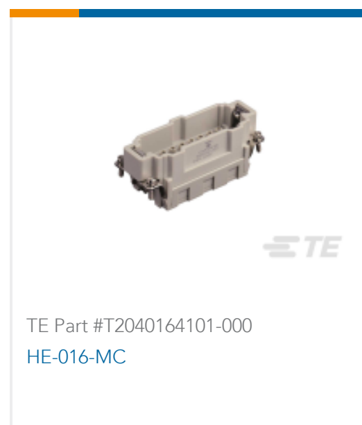
TE Part #T2040164101-000 HE-016-MC