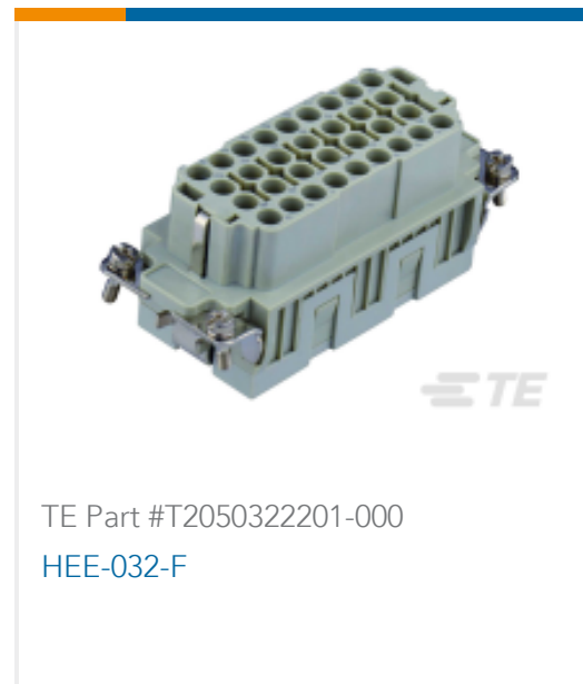
TE Part #T2050322201-000 HEE-032-F