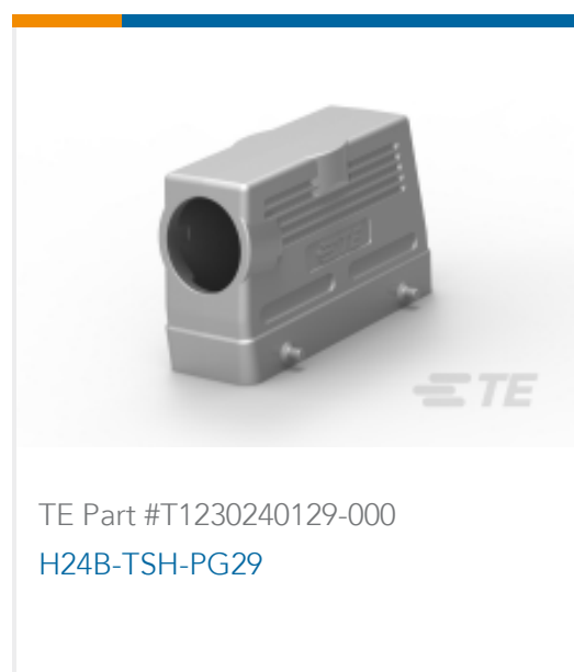
TE Part #T1230240129-000 H24B-TSH-PG29