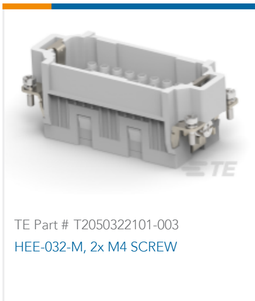
TE Part # T2050322101-003 HEE-032-M, 2x M4 SCREW