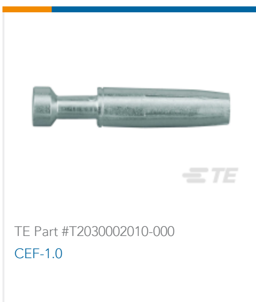
TE Part #T2030002010-000 CEF-1.0