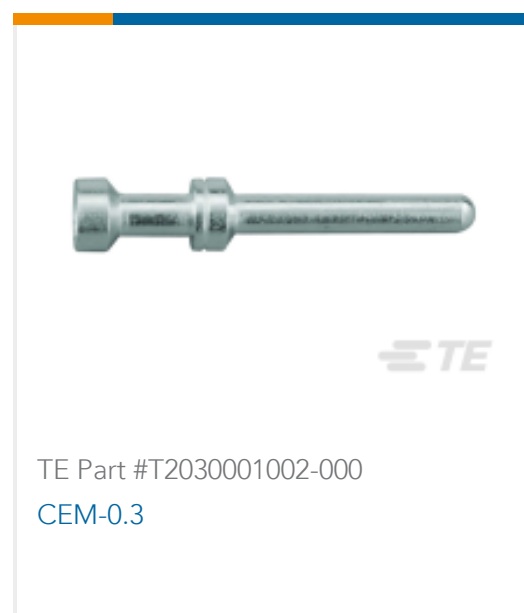
TE Part #T2030001002-000 CEM-0.3