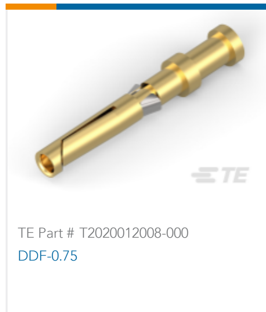
TE Part # T2020012008-000 DDF-0.75