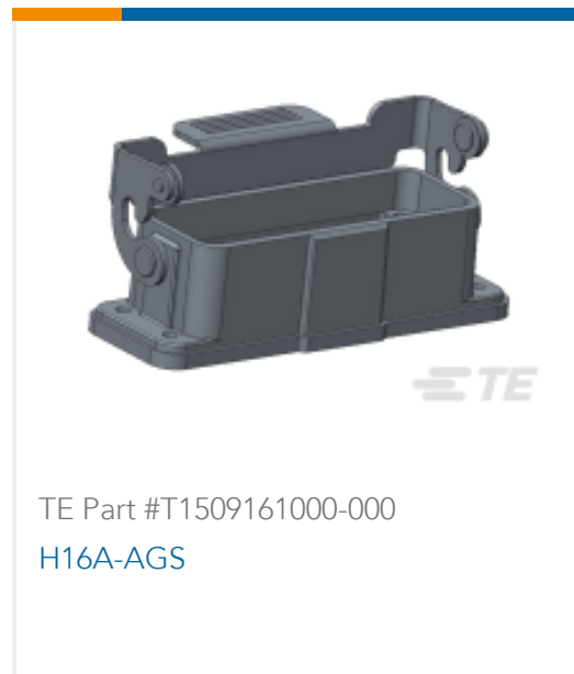
TE Part #T1509161000-000 H16A-AGS