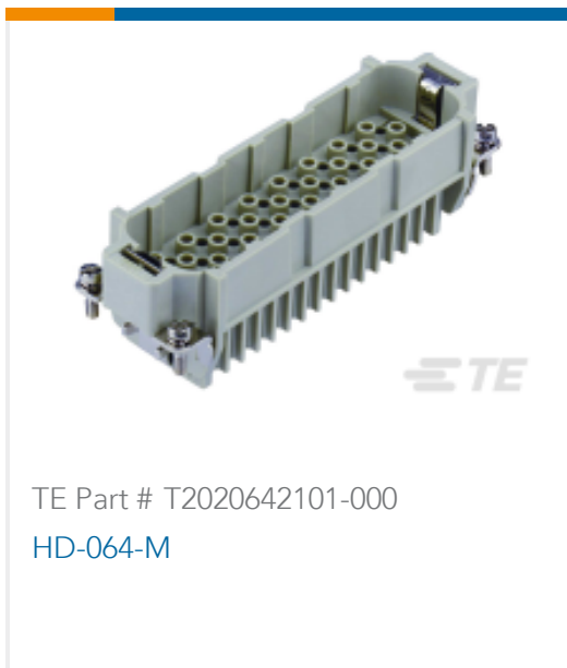
TE Part # T2020642101-000 HD-064-M