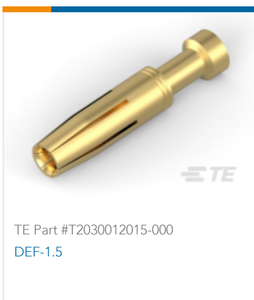
TE Part #T2030012015-000 DEF-1.5