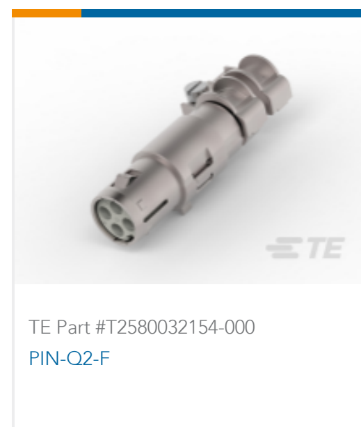
TE Part #T2580032154-000 PIN-Q2-F