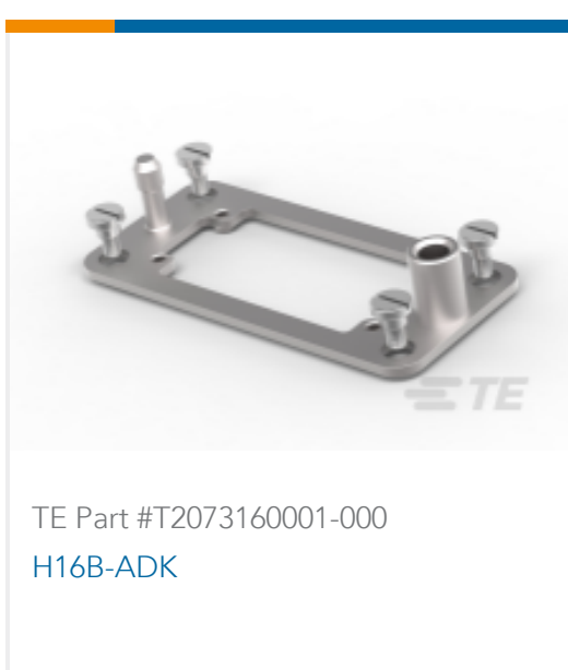
TE Part #T2073160001-000 H16B-ADK