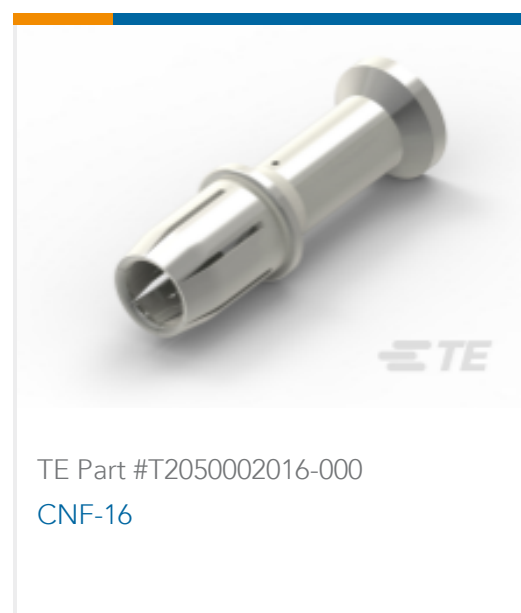
TE Part #T2050002016-000 CNF-16