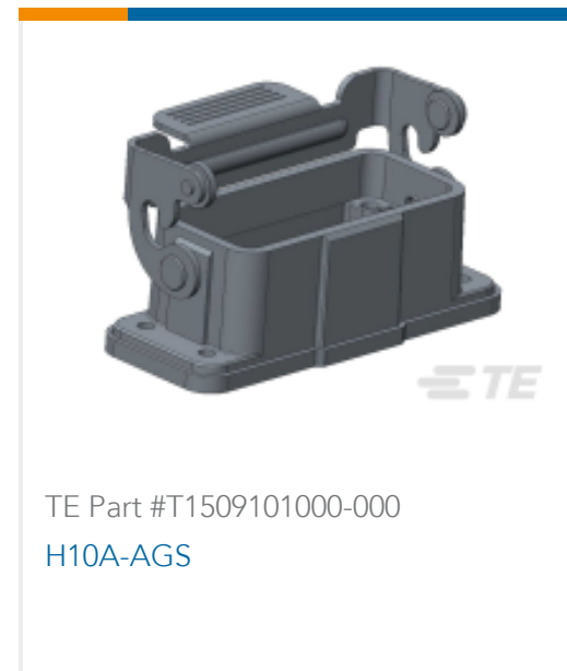
TE Part #T1509101000-000 H10A-AGS