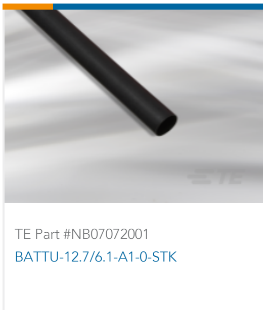
TE Part #NB07072001 BATTU-12.7/6.1-A1-0-STK