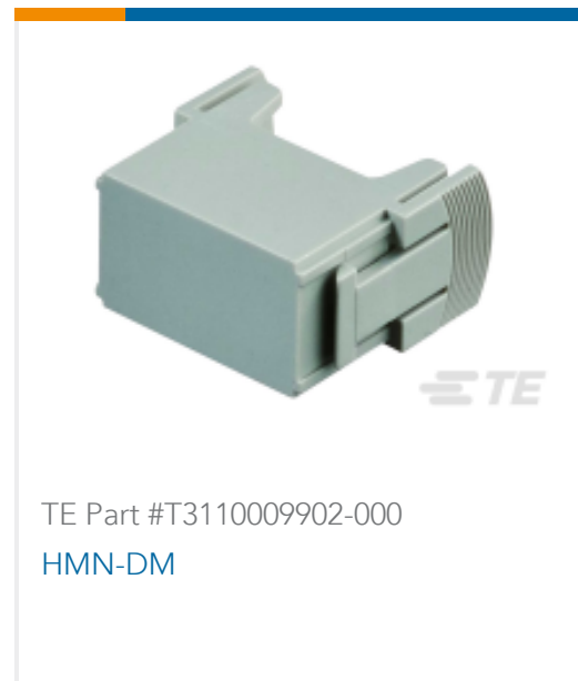
TE Part #T3110009902-000 HMN-DM