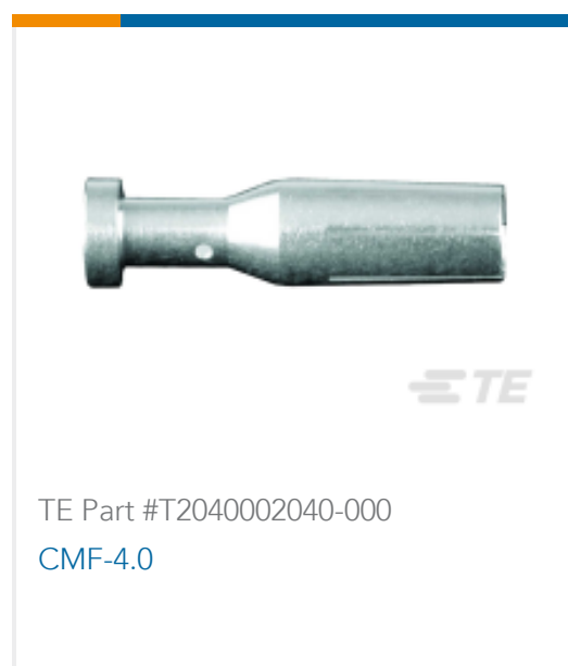
TE Part #T2040002040-000 CMF-4.0