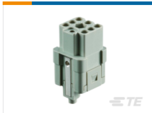
TE Part #T2080072201-000 HQ-007-F