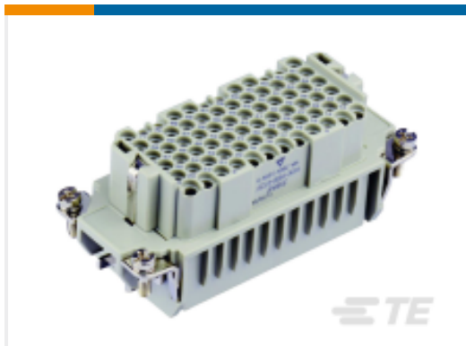
TE Part #T2030722201-000 HDD-072-F