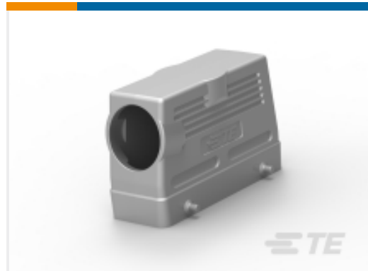
TE Part #T1230240140-000 H24B-TSH-M40