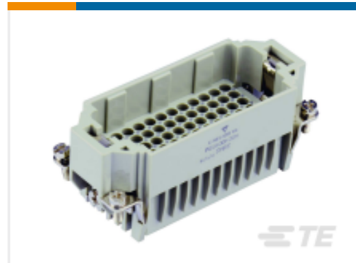
TE Part #T2030722101-000 HDD-072-M