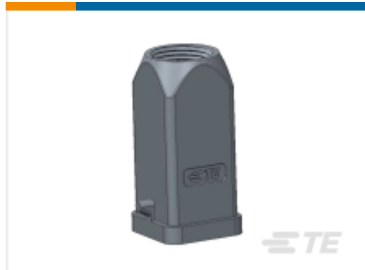
TE Part #T1329030120-000 H3A-MTG-M20