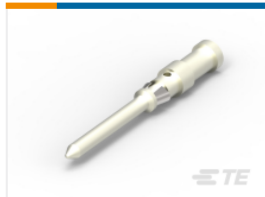
TE Part #T2020001005-000 CDM-0.5