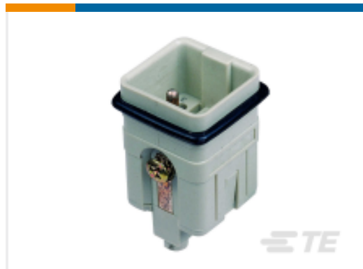
TE Part #T2080052101-000 HQ-005-M