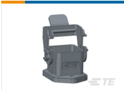
TE Part #T1509030000-000 H3A-MAG