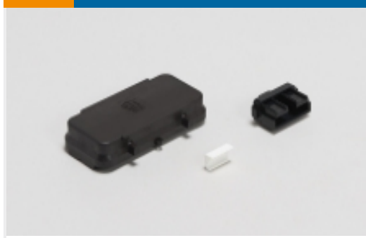
Rectangular Caps & Covers(4)