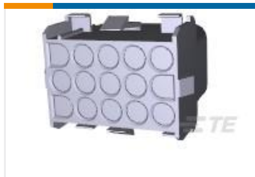
TE Part #1-480711-9 15P UMNL CAP HSG BLK