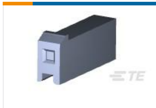
TE Part #640250-1 01P SL156 HSG W/LCK RAMP NATL