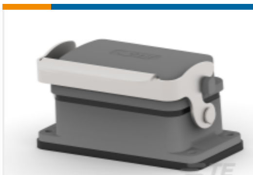
TE Part #T2120100220-000 ZGGP-H10BSK 1-7/2-8/3-9/4-6/5-10