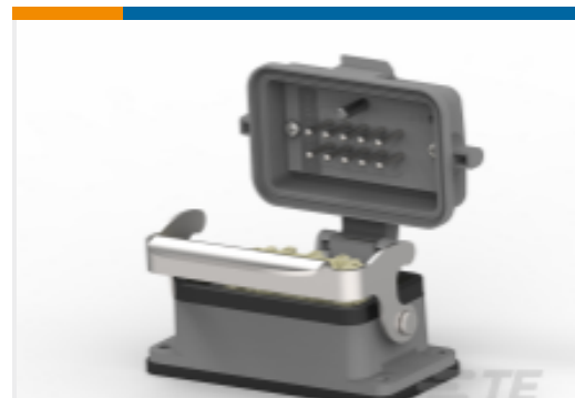
TE Part #T2120100219-000 ZGG-10DSTK,1-7,2-8,3-9,4-6,5-10