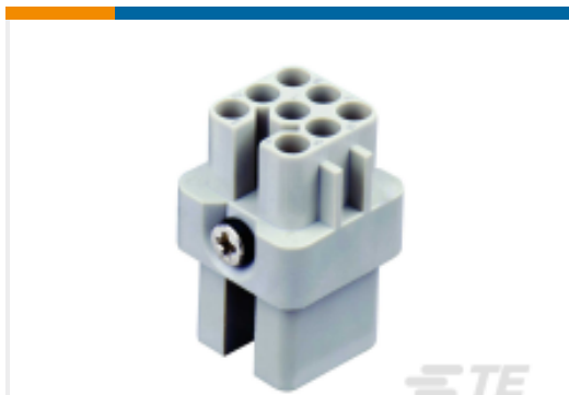
TE Part #T2020082201-000 HD-008-F