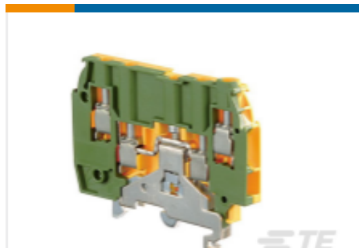
TE Part #1SNA195638R2300 M4/6.4A.P