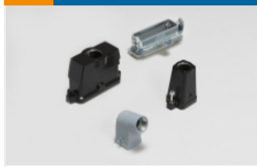
Rectangular Connector Hoods & Bases (445)