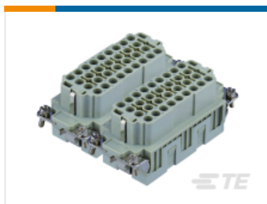
TE Part #T2051283201-000 HEEE-064-F 65-128