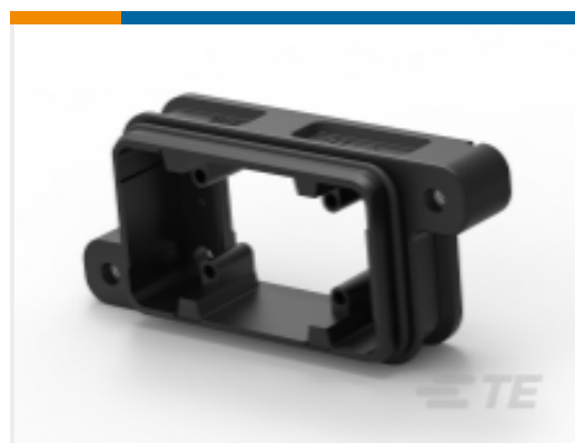
TE Part #T1930060000-009 H6BPR-AG-EMC-C