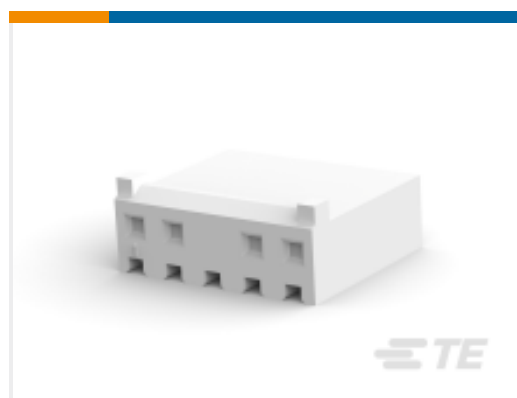
TE Part #647344-5 05P SL156 HSG W/RP TB BLK #3