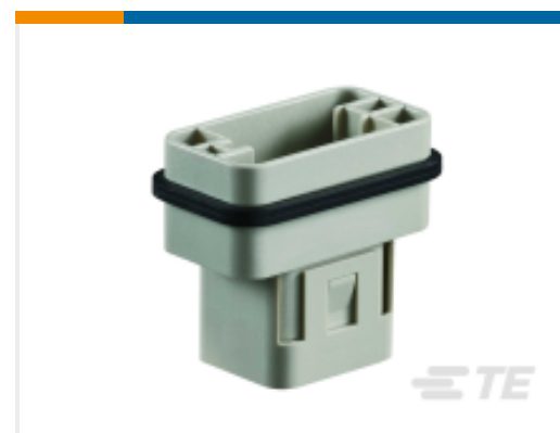
TE Part #T2019092101-000 HQ-008-M