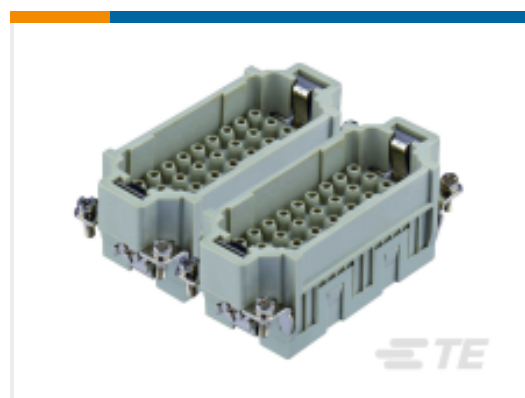
TE Part #T2051283101-000 HEEE-064-M 65-128