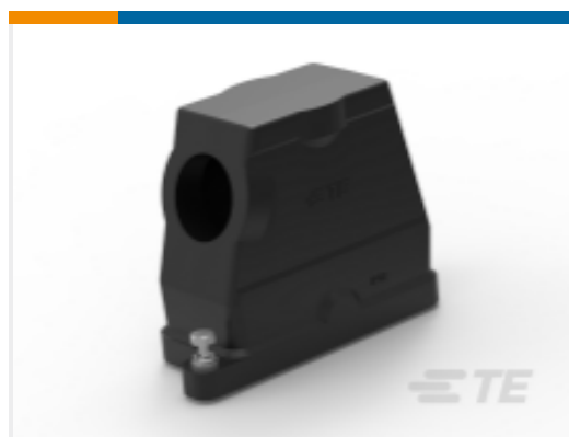
TE Part #T1910160140-009 H16BPR-TSH-M40-EMC-C