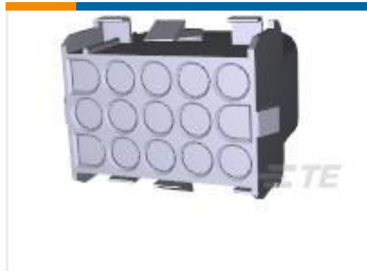
TE Part #1-480711-9 15P UMNL CAP HSG BLK