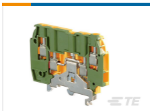
TE Part #1SNA195638R2300 M4/6.4A.P