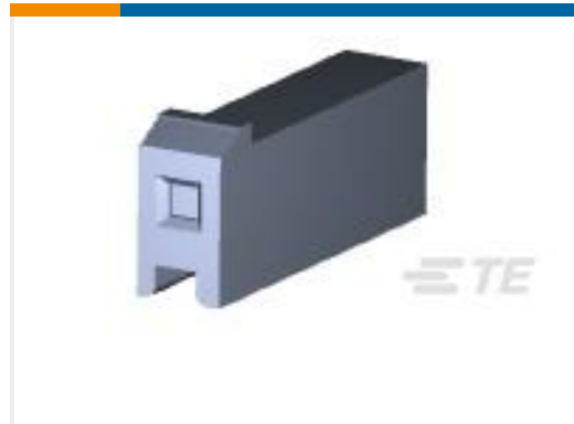
TE Part #640250-1 01P SL156 HSG W/LCK RAMP NATL