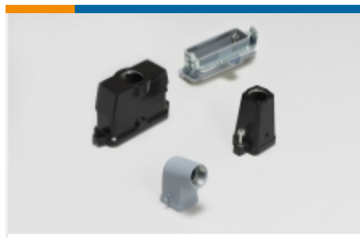
Rectangular Connector Hoods & Bases (445)