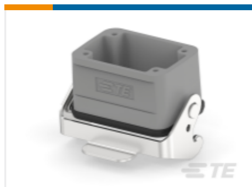
TE Part #T1730060000-000 H6B-TBF-T