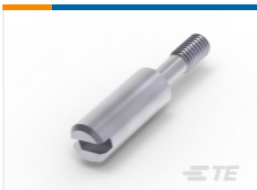
TE Part #T0931003003-000 CODING-PIN-M3