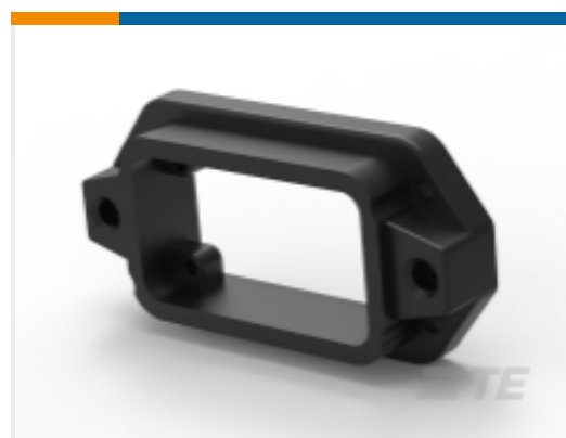
TE Part # T1932100000-009 H10BPR-AGC-EMC-C