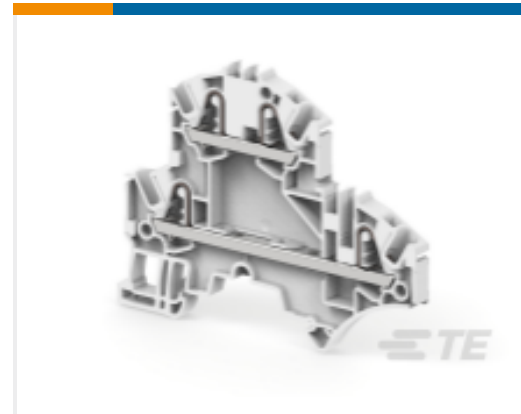
TE Part #1SNK705210R0000 ZK2.5-D2