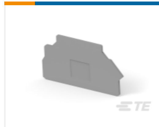
TE Part #1SNK508960R0000 ES4-SF