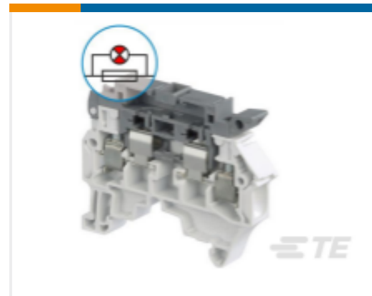
TE Part #1SNK508412R0000 ZS4-SF1-R1