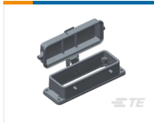
TE Part #T1430240000-000 H24B-AD-BO