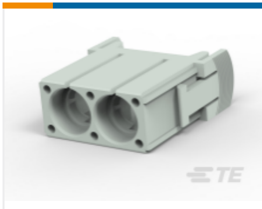
TE Part #T2111022301-000 HMN-PA2