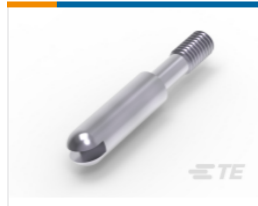
TE Part #T0931000423-000 CODING-PIN-M3-TM