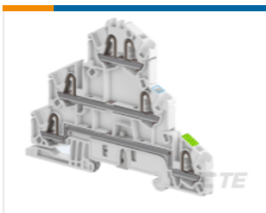
TE Part #1SNK705513R0000 ZK2.5-L-N-PE