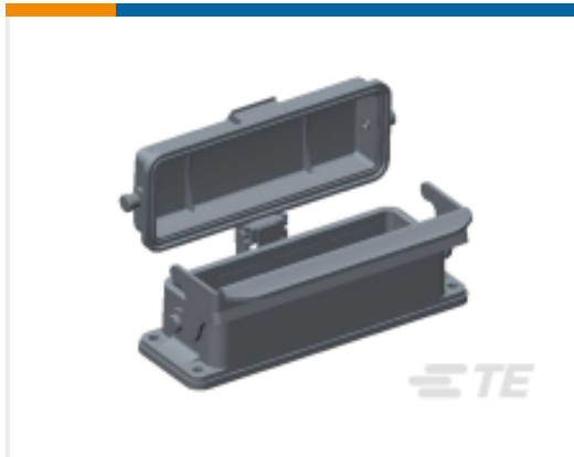
TE Part #T1510243000-000 H24B-AD-LB