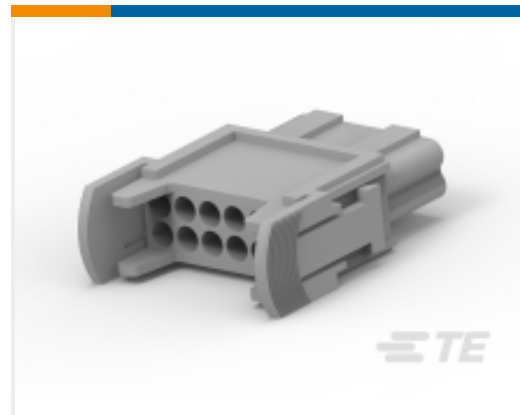
TE Part #T2111122201-000 HMN-012-F