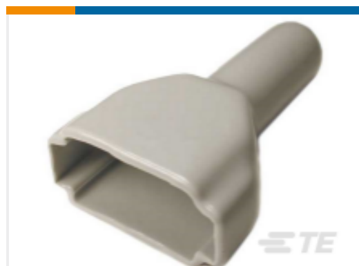
TE Part #DT12S-BT BOOT, 12P, PLG, ST, GRY