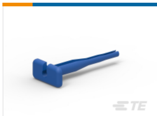
TE Part #0411-310-1605 EXT TOOL, SIZE 16, 16-18 AWG, T, LT BLU