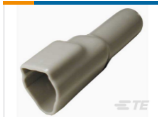
TE Part #DT3P-BT BOOT, 3P, REC, ST, GRY