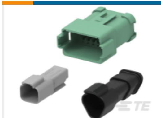
TE Part #DT04-12PA-L012 DEUTSCH DT Receptacle Connectors