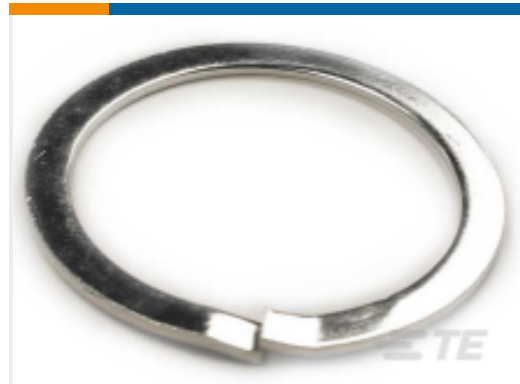
TE Part #112264-ZZ LOCKWASHER, SIZE 24, HD30