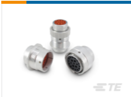
TE Part #HD36-24-23SE DEUTSCH HD30 Housings