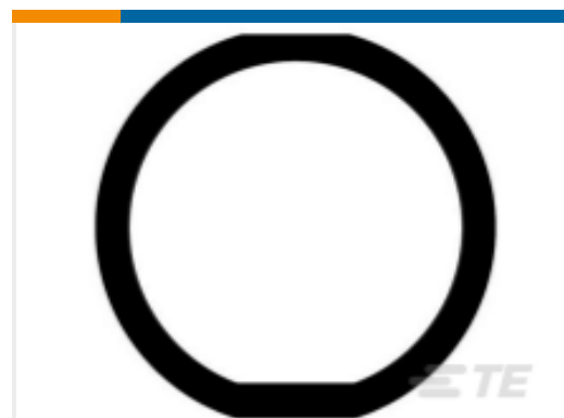
TE Part #16-04477 GASKET, 24SZ, BLK, HD30