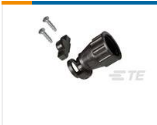
TE Part #1-206062-4 CABLE CLAMP KIT #11