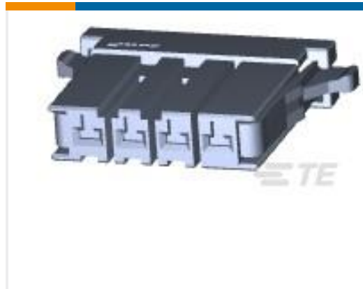
TE Part #1-178128-4 DYNAMIC 3200 REC HSG 4P SGL