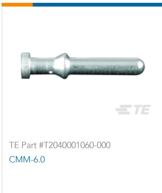
TE Part #T2040001060-000 CMM-6.0