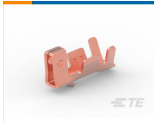
TE Part #2174065-4 REC. CONT. FMG. M-MOTOR PLUS