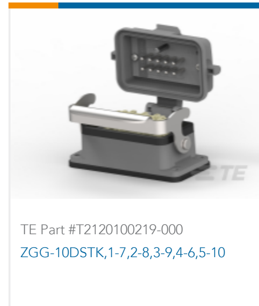
TE Part #T2120100219-000 ZGG-10DSTK,1-7,2-8,3-9,4-6,5-10