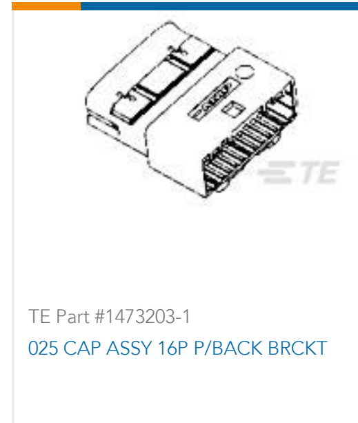
TE Part #1473203-1 025 CAP ASSY 16P P/BACK BRCKT