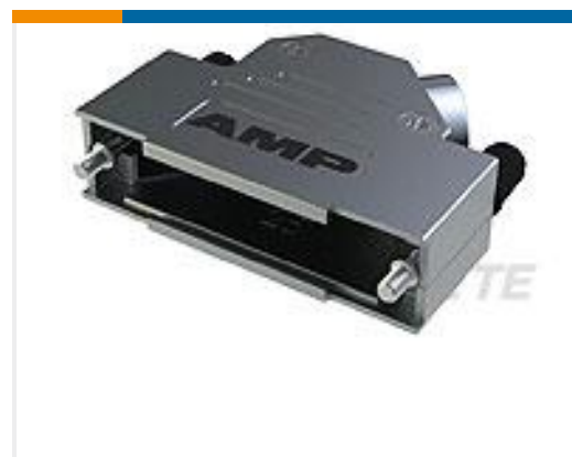
TE Part #5-1478763-1 Metal backshell 9 way 45 Deg E