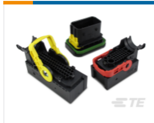
TE Part #5-1718321-3 LEAVYSEAL Housings