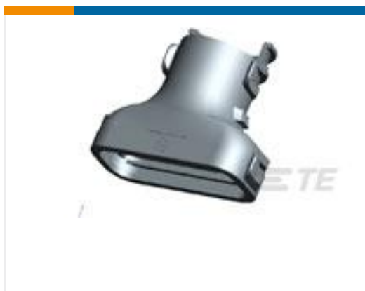
TE Part #1670866-1 COVER,180