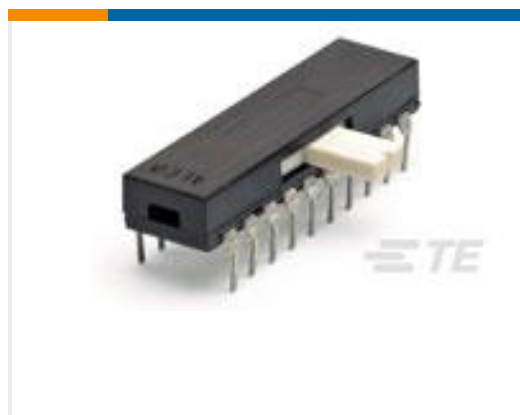
TE Part #1-1825010-4 ASE42G04=4PDT AUTOSLIDE