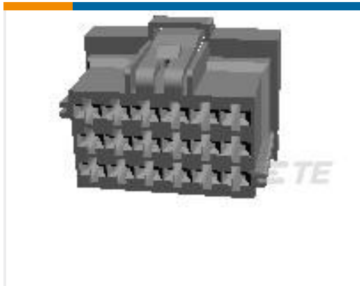
TE Part #8-968974-1 MCP2.8 GEH 18P