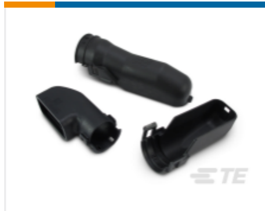
TE Part #9-1394050-1 LEAVYSEAL Backshells