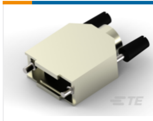
TE Part #5-1478762-1 Metal backshell 9 way Top Entry-KIT