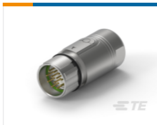
TE Part #AKA021M04620200000 623 EXTENSION, SPEEDTEC-READY