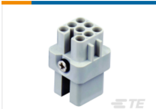
TE Part #T2020082201-000 HD-008-F