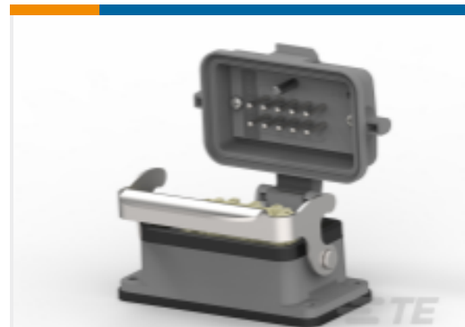
TE Part #T2120100219-000 ZGG-10DSTK,1-7,2-8,3-9,4-6,5-10