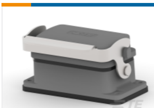
TE Part #T2120100220-000 ZGGP-H10BSK 1-7/2-8/3-9/4-6/5-10