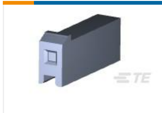
TE Part #640250-1 01P SL156 HSG W/LCK RAMP NATL