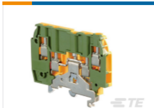
TE Part #1SNA195638R2300 M4/6.4A.P