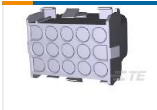
TE Part #1-480711-9 15P UMNL CAP HSG BLK