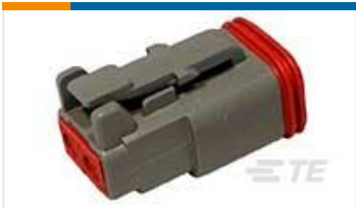
TE Part #DT06-2S PLG, 2P, GRY, N