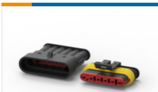
TE Part #282080-1 AMP SUPERSEAL 1.5MM, CONNECTOR HOUSING