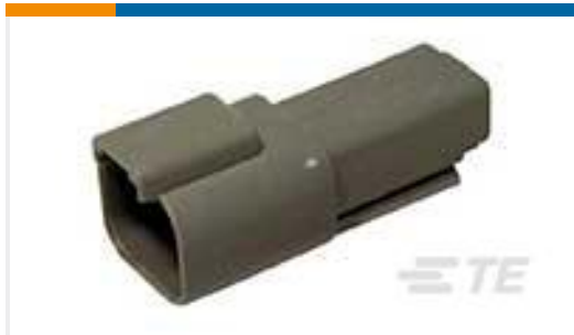
TE Part #DT04-2P REC, 2P, GRY, N