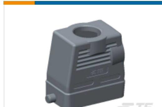
TE Part #T1340100132-000 H10B-TGH-RO-M32