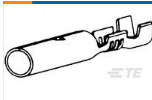
TE Part #60799-2 SHUR PLUG 180 RECEPTACLE 18-14 AWG BR