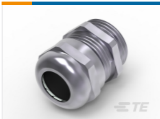
TE Part #T3609250102-000 DLX-25-M