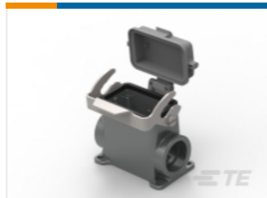
TE Part #T1660103132-000 H10B-SDRH-LB-M32