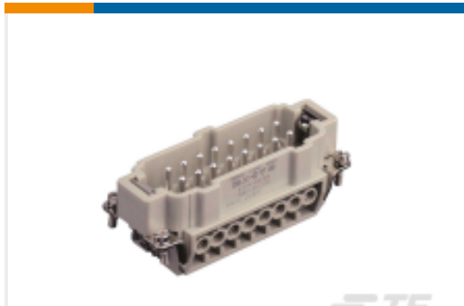
TE Part #T2040162101-000 HE-016-M