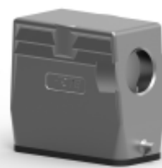
TE Part # T1319100125-000 H10A-TS-M25