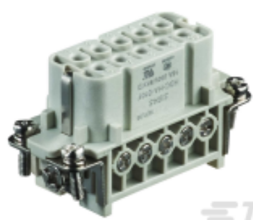
TE Part # T2010102201-000 HA-010-F