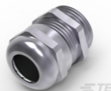
TE Part # T3609250102-000 DLX-25-M