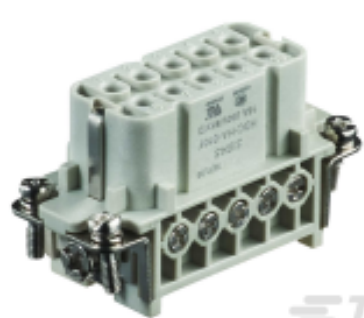
TE Part # T2010102201-000 HA-010-F