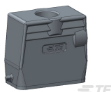
TE Part # T1329100116-000 H10A-TG-PG16