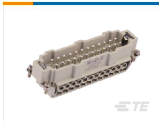
TE Part #T2040242101-000 HE-024-M