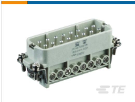
TE Part #T2010162101-000 HA-016-M