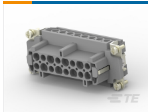
TE Part #T2040162201-000 HE-016-F