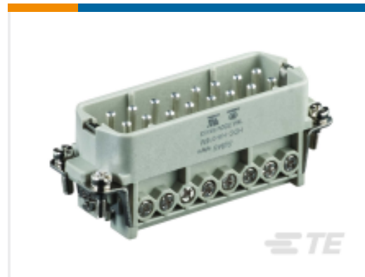
TE Part #T2010322101-000 HA-016-M 17-32