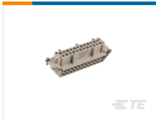
TE Part #T2040242201-000 HE-024-F