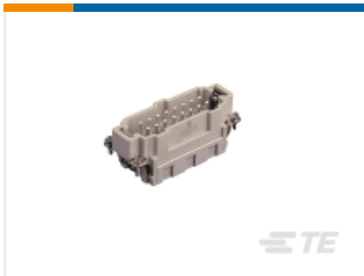
TE Part #T2040163101-000 HE-016-MS