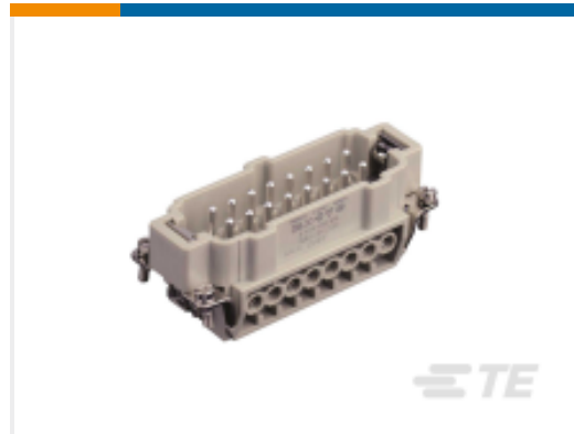
TE Part #T2040162101-000 HE-016-M