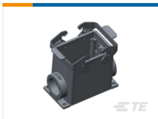
TE Part #T1449320121-000 H32A-SGR-PG21