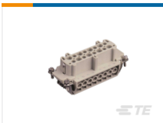
TE Part #T2040322201-000 HE-016-F 17-32