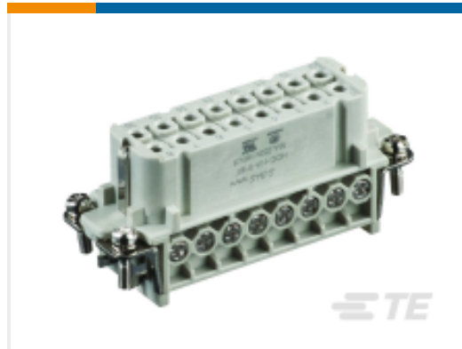
TE Part #T2010162201-000 HA-016-F