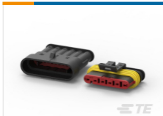
TE Part #282080-1 AMP SUPERSEAL 1.5MM, CONNECTOR HOUSING