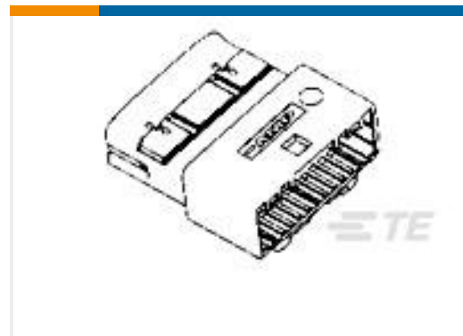
TE Part #1473203-1 025 CAP ASSY 16P P/BACK BRCKT