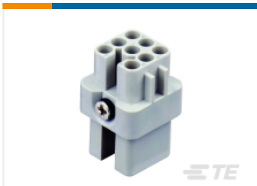
TE Part #T2020082201-000 HD-008-F