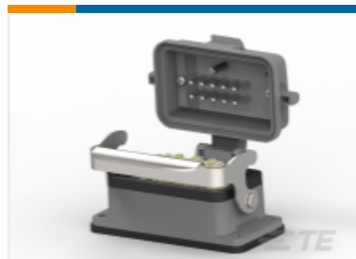
TE Part #T2120100219-000 ZGG-10DSTK,1-7,2-8,3-9,4-6,5-10