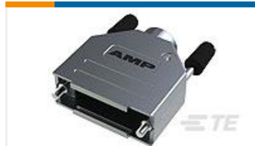
TE Part #3-1478762-7 METAL BACKSHELL 37 WAY TOP E