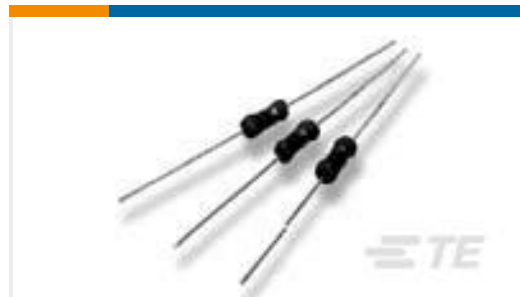
TE Part #3-1625890-8 2W SM M/OX 5% 2K2