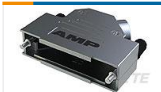
TE Part #5-1478763-2 Metal backshell 15 way 45 Deg Entry-KIT