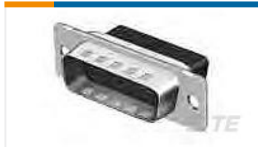
TE Part #167293-1 15P.HDP20 PLUG ASSY