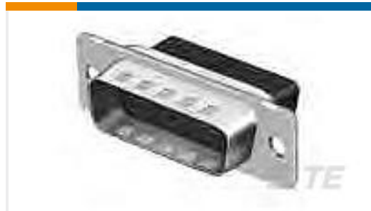
TE Part #167294-1 25P HDP20 PLUG ASSY