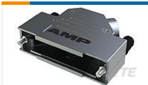
TE Part #3-1478763-7 METAL BACKSHELL 37 WAY 45 DE