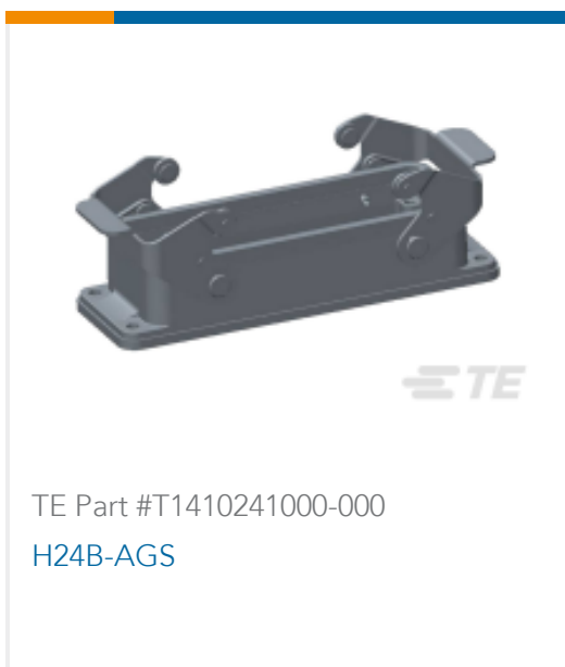
TE Part #T1410241000-000 H24B-AGS