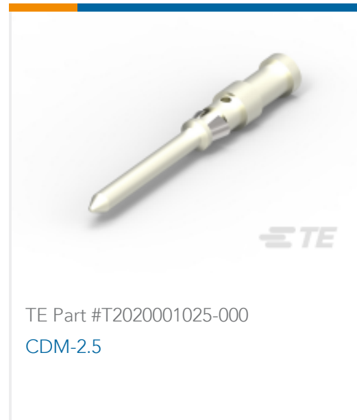
TE Part #T2020001025-000 CDM-2.5