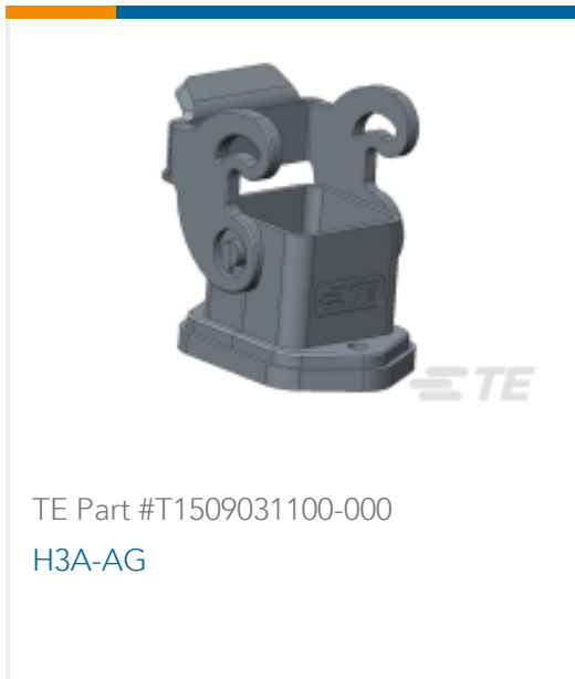
TE Part #T1509031100-000 H3A-AG