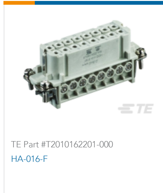
TE Part #T2010162201-000 HA-016-F