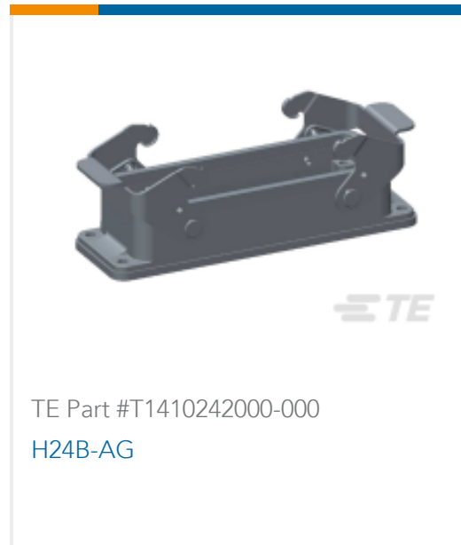
TE Part #T1410242000-000 H24B-AG