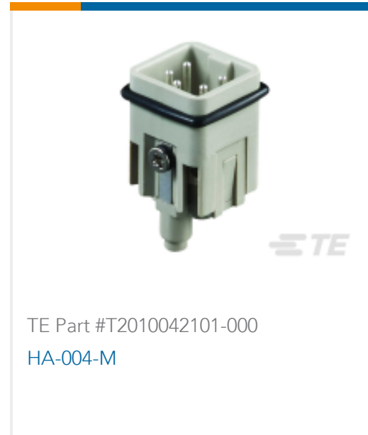
TE Part #T2010042101-000 HA-004-M