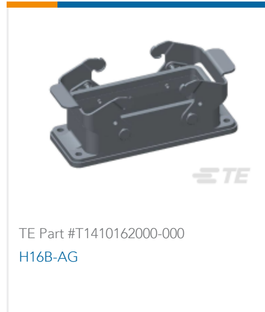
TE Part #T1410162000-000 H16B-AG