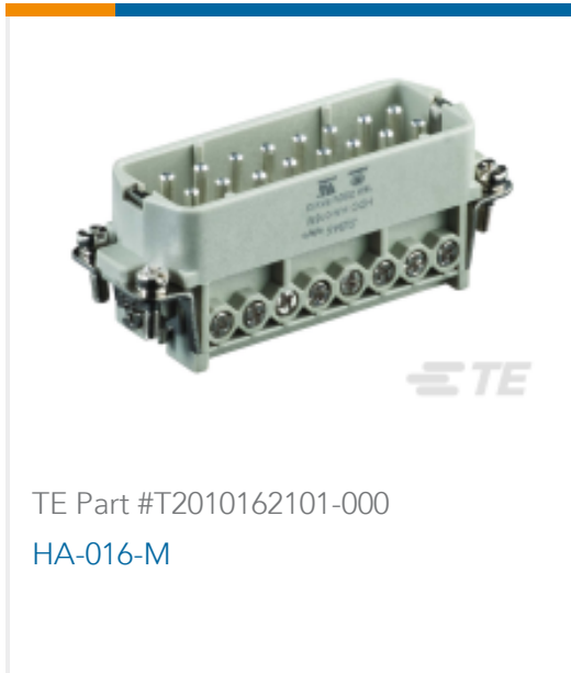
TE Part #T2010162101-000 HA-016-M