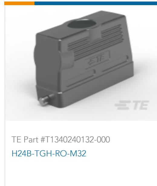
TE Part #T1340240132-000 H24B-TGH-RO-M32