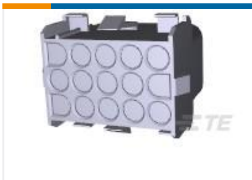
TE Part #1-480711-9 15P UMNL CAP HSG BLK