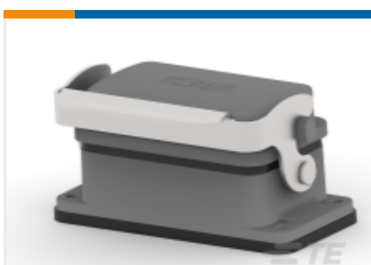
TE Part #T2120100220-000 ZGGP-H10BSK 1-7/2-8/3-9/4-6/5-10