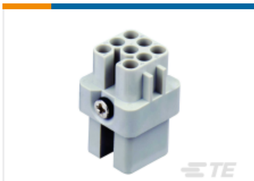
TE Part #T2020082201-000 HD-008-F