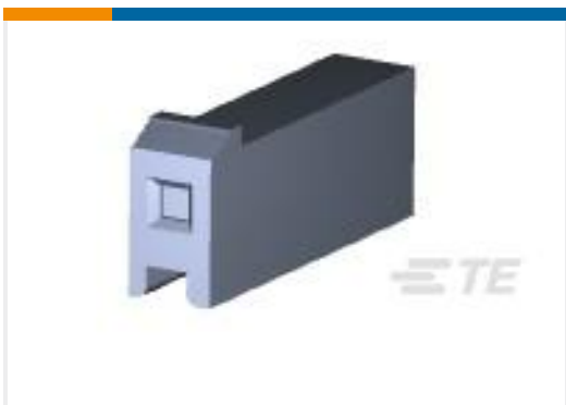
TE Part #640250-1 01P SL156 HSG W/LCK RAMP NATL