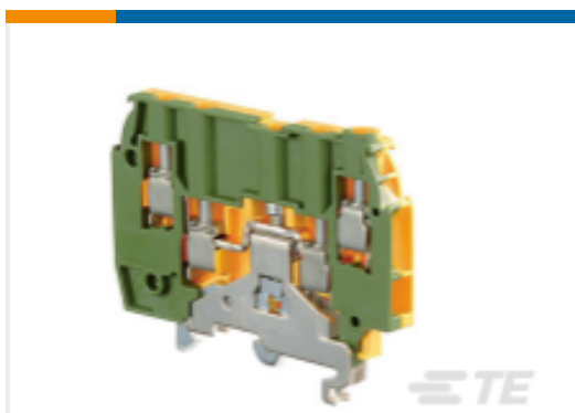
TE Part #1SNA195638R2300 M4/6.4A.P