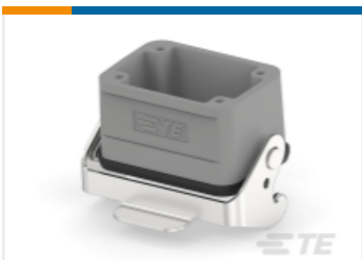
TE Part #T1730060000-000 H6B-TBF-T