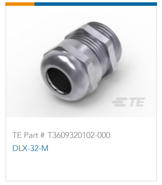
Also in the Series | HDC IP65