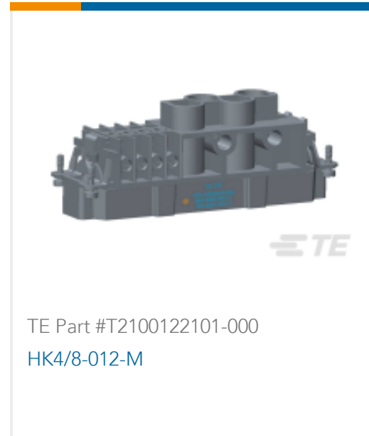
TE Part #T2100122101-000 HK4/8-012-M