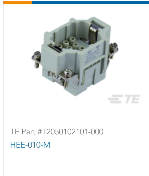
TE Part #T2050102101-000 HEE-010-M