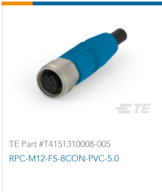
TE Part #T4151310008-005 RPC-M12-FS-8CON-PVC-5.0