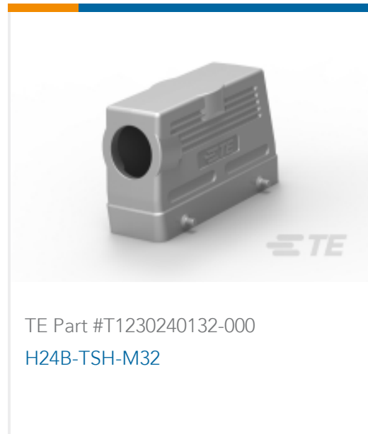
TE Part #T1230240132-000 H24B-TSH-M32