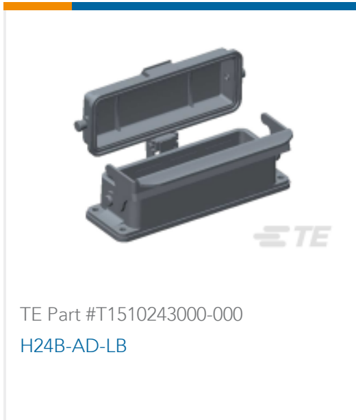
TE Part #T1510243000-000 H24B-AD-LB