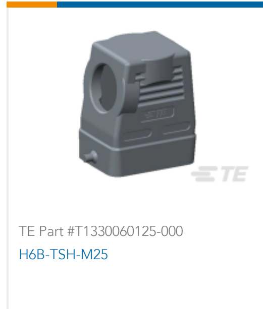
TE Part #T1330060125-000 H6B-TSH-M25