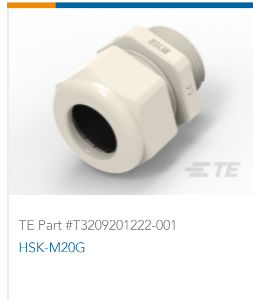
TE Part #T3209201222-001 HSK-M20G