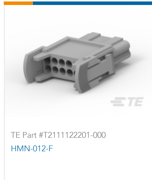
TE Part #T2111122201-000 HMN-012-F