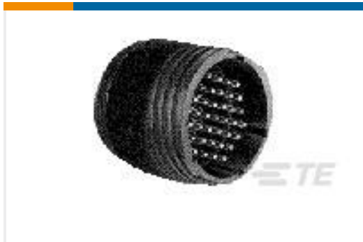
TE Part #206705-2 CPC 13-9 FREE HANGING RECPT