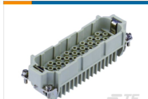
TE Part #T2020642101-000 HD-064-M