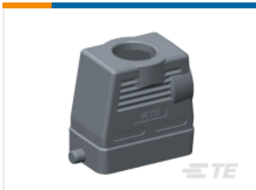
TE Part #T1340100132-000 H10B-TGH-RO-M32