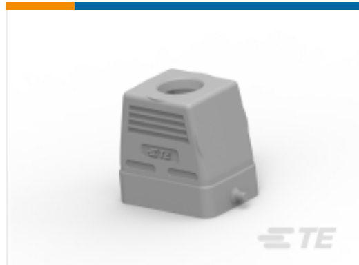
TE Part #T1320060125-000 H6B-TG-M25