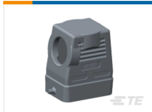
TE Part #T1330060125-000 H6B-TSH-M25