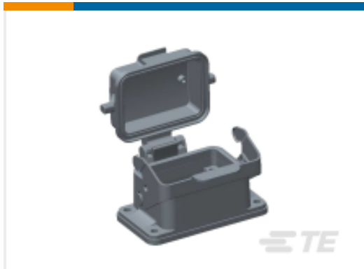
TE Part #T1510063000-000 H6B-AD