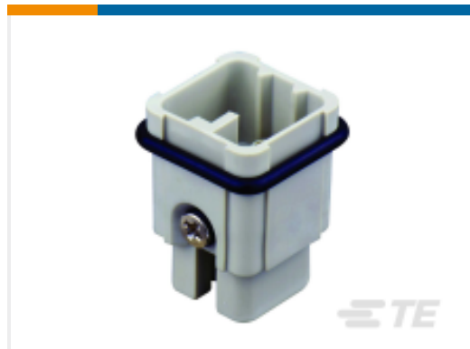
TE Part #T2020072101-000 HD-007-M