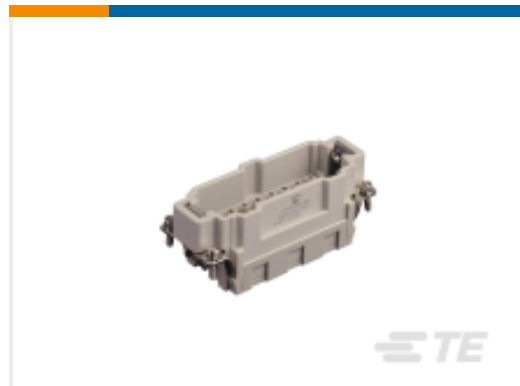
TE Part #T2040164101-000 HE-016-MC