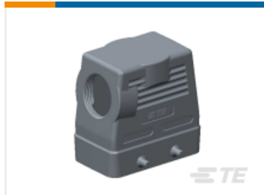
TE Part #T1230160132-000 H16B-TSH-M32