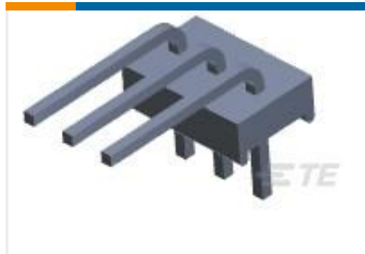
TE Part #640453-3 03P MTA100 HDR ASSY SQ R/A