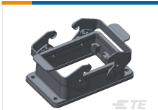
TE Part #T1419320000-000 H32A-AG