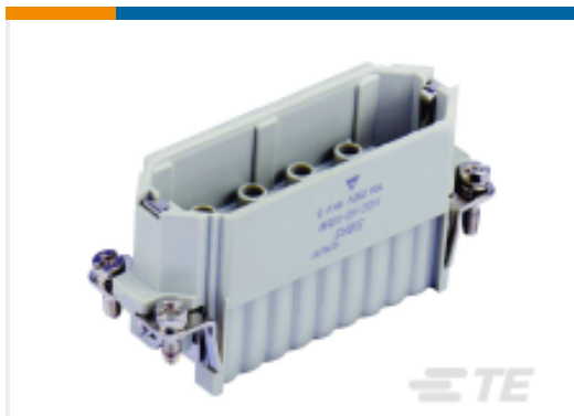
TE Part #T2020252101-000 HD-025-M