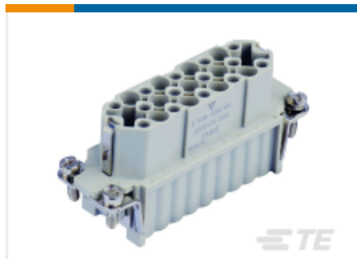
TE Part #T2020252201-000 HD-025-F