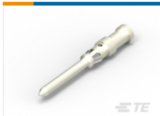
TE Part #T2020001005-000 CDM-0.5