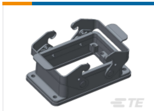
TE Part #T1419320000-000 H32A-AG