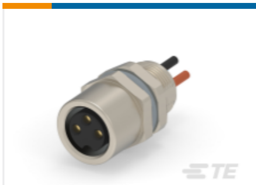
TE Part #T4073014031-001 M8.FMLE.PNLFRONT.3POS.STR WIRE