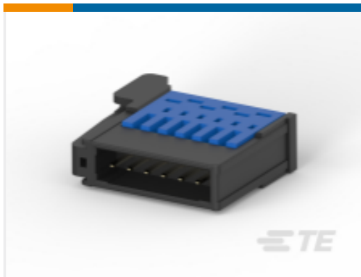
TE Part #2-2295044-6 RITS CONN. PLUG ASSY 6P BLUE TIN