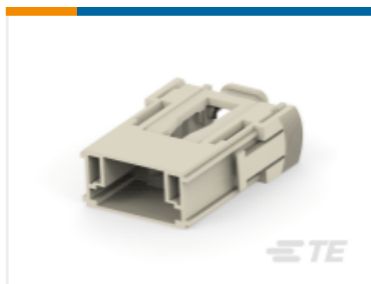
TE Part #T2113000101-200 HMN-RJ45-M