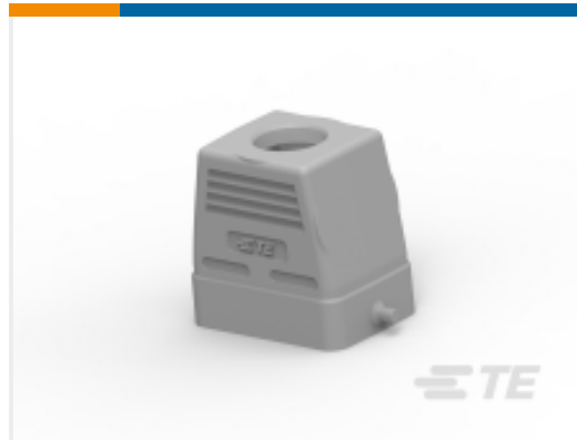
TE Part #T1320060132-000 H6B-TG-M32