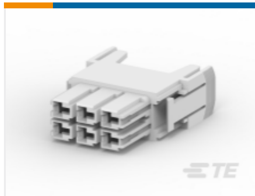
TE Part #2312736-2 HMN-HD4-6-F