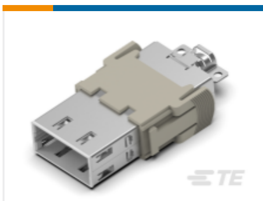
TE Part #T2111322101-000 HMN-HD1-32-M,8.45