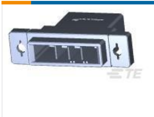
TE Part #1-179553-4 DYNAMIC D-3200S TAB HSG 4P K/X