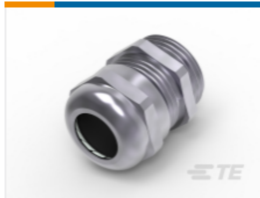
TE Part #T3609400102-000 DLX-40-M