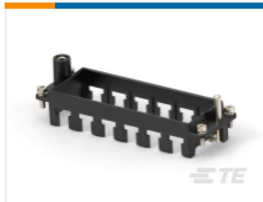
TE Part #T2070244101-002 H24BN-T6-M-HD