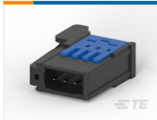
TE Part #2-2295044-3 RITS CONN. PLUG ASSY 3P BLUE TIN