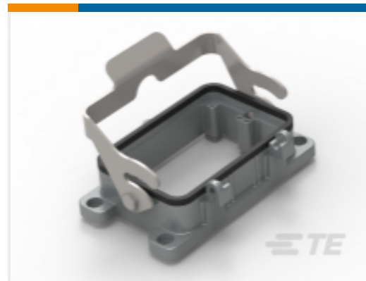
TE Part #T1500482000-000 H48B-AG-LB