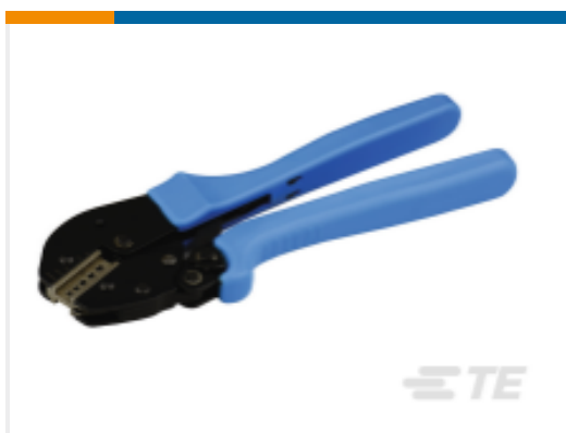
TE Part #T3100000001-000 CRIMPBOX-0.14/4.0