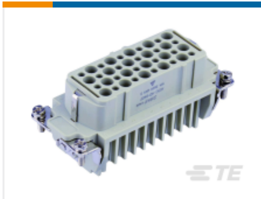
TE Part #T2020402201-000 HD-040-F