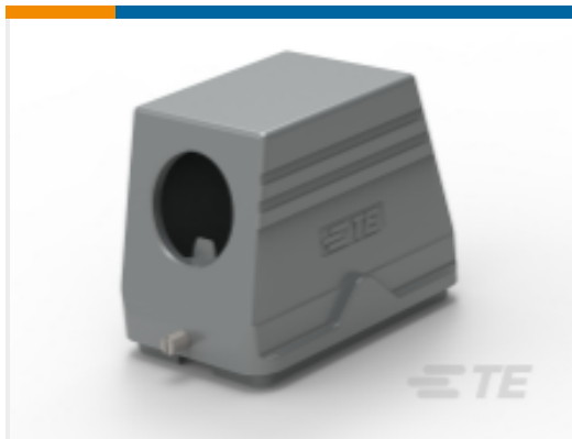
TE Part #T1310480129-000 H48B-TS-RO-PG29