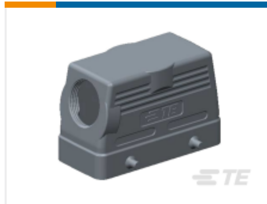
TE Part #T1210160121-000 H16B-TS-PG21