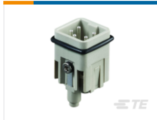
TE Part #T2010042101-000 HA-004-M