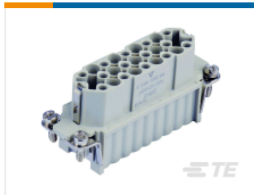
TE Part #T2020252201-000 HD-025-F