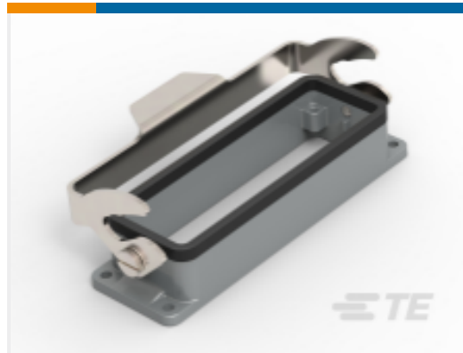
TE Part #T1500243000-000 H24B-AG-LB