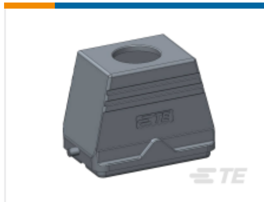
TE Part #T1320480136-000 H48B-TG-RO-PG36