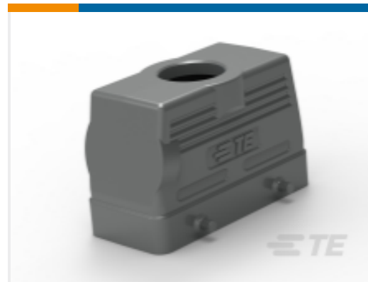
TE Part #T1220160121-000 H16B-TG-PG21