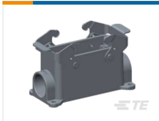
TE Part #T1440162121-000 H16B-SGR-PG21