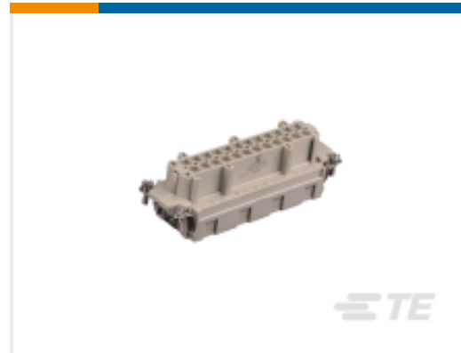
TE Part #T2040243201-000 HE-024-FS