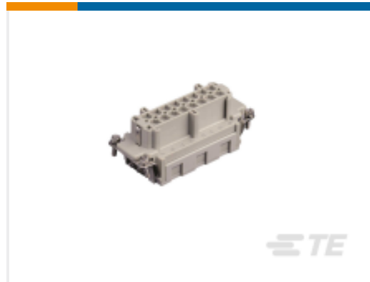
TE Part #T2040163201-000 HE-016-FS