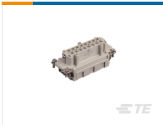
TE Part #T2040164201-000 HE-016-FC