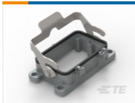
TE Part #T1500482000-000 H48B-AG-LB