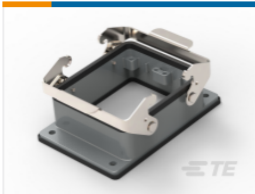
TE Part #T1410322000-000 H32B-AG