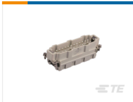
TE Part #T2040483101-000 HE-024-MS 25-48