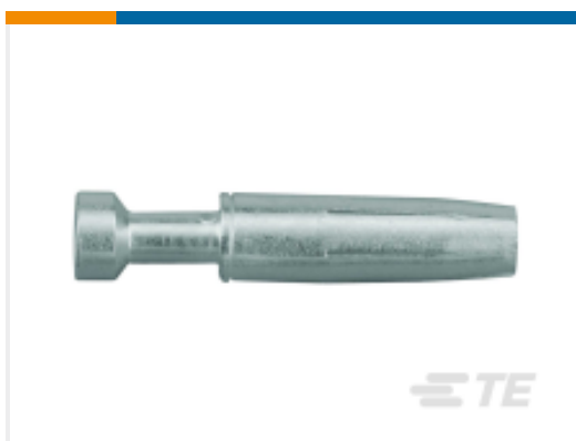
TE Part #T2030002040-000 CEF-4.0