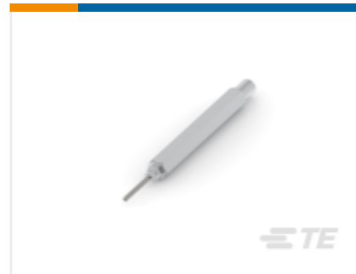
TE Part #T3100000003-000 REMOV-HD