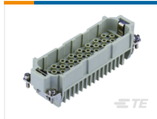
TE Part #T2020642101-000 HD-064-M