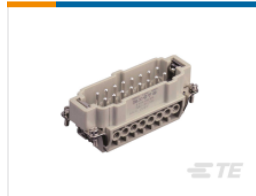
TE Part #T2040162101-000 HE-016-M