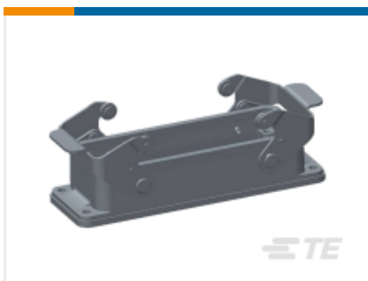
TE Part #T1410241000-000 H24B-AGS