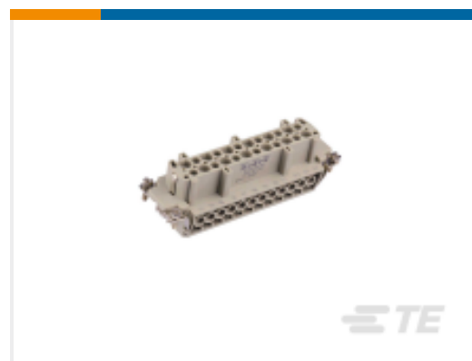
TE Part #T2040242201-000 HE-024-F