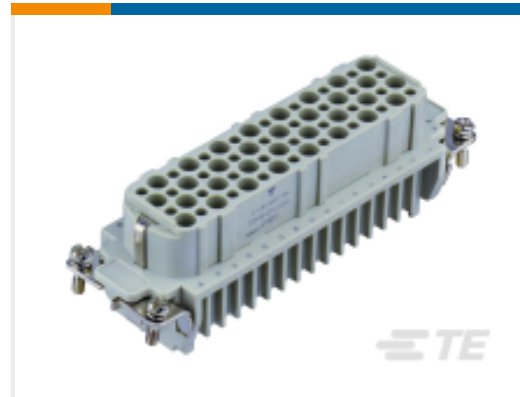
TE Part #T2020642201-000 HD-064-F