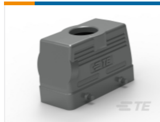
TE Part #T1220160116-000 H16B-TG-PG16