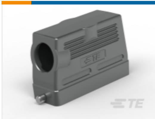
TE Part #T1330240129-000 H24B-TSH-RO-PG29