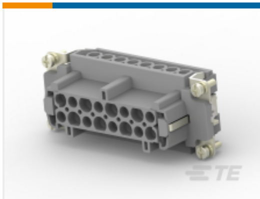
TE Part #T2040162201-000 HE-016-F