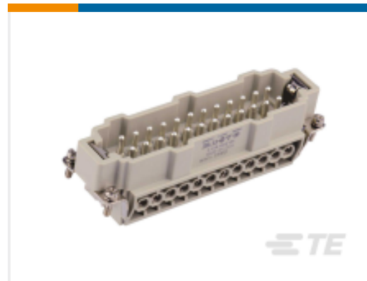
TE Part #T2040242101-000 HE-024-M