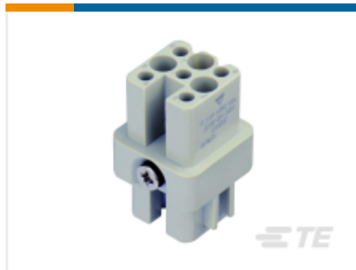
TE Part #T2020072201-000 HD-007-F