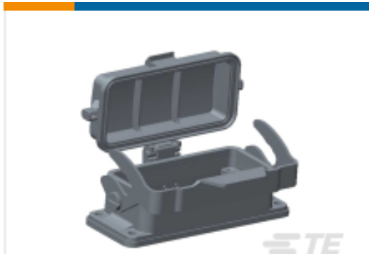
TE Part #T1510163000-000 H16B-AD-LB