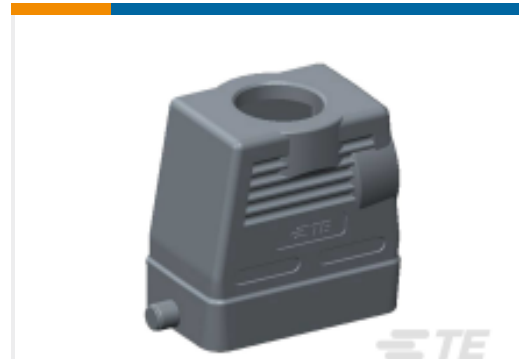
TE Part #T1340100132-000 H10B-TGH-RO-M32