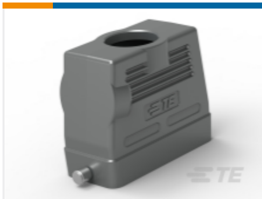
TE Part #T1340160125-000 H16B-TGH-RO-M25