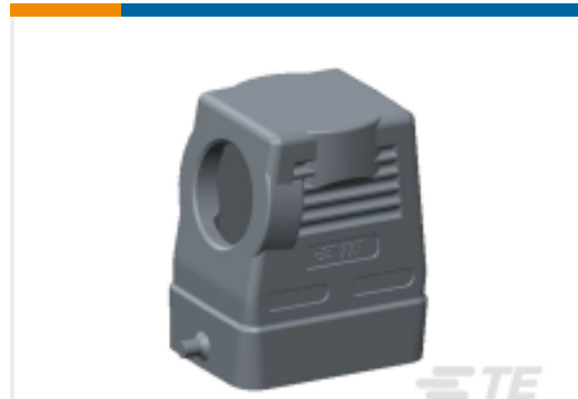
TE Part #T1330060125-000 H6B-TSH-M25