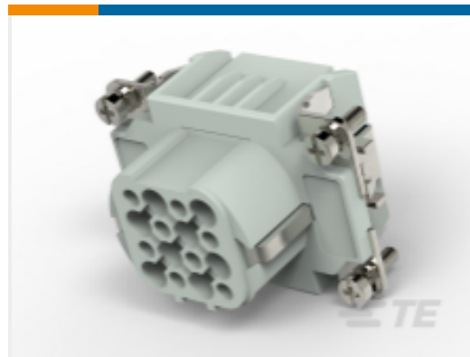
TE Part #T2030162201-000 HDD-016-F