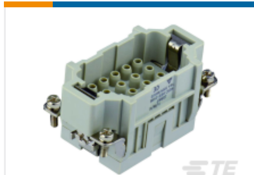
TE Part #T2050182101-000 HEE-018-M