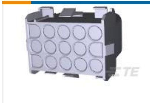
TE Part #1-480711-9 15P UMNL CAP HSG BLK