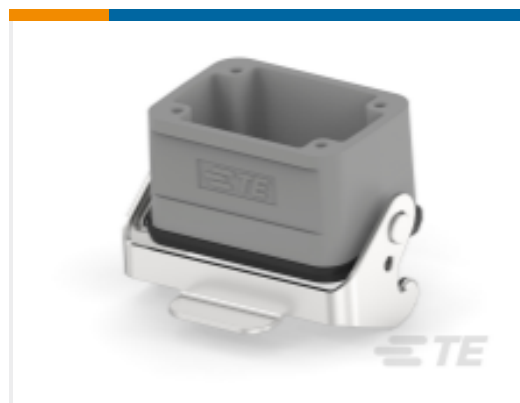
TE Part #T1730060000-000 H6B-TBF-T