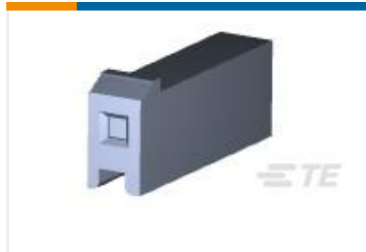
TE Part #640250-1 01P SL156 HSG W/LCK RAMP NATL