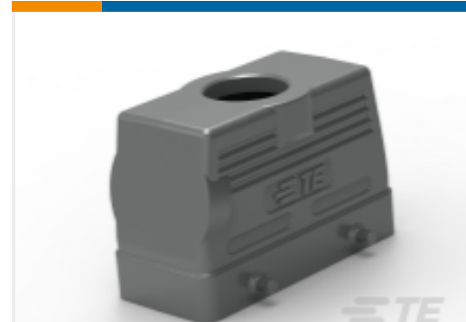
TE Part #T1220160121-000 H16B-TG-PG21