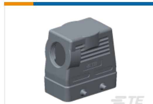
TE Part #T1230160121-000 H16B-TSH-PG21