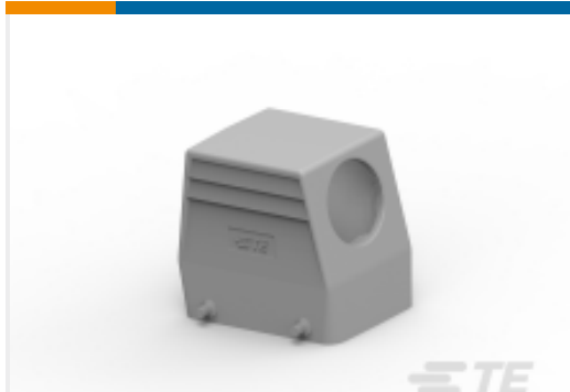
TE Part #T1319320129-000 H32A-TS-PG29