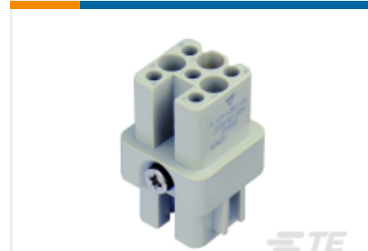
TE Part #T2020072201-000 HD-007-F