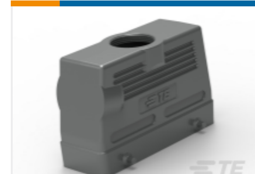
TE Part #T1240240129-000 H24B-TGH-PG29