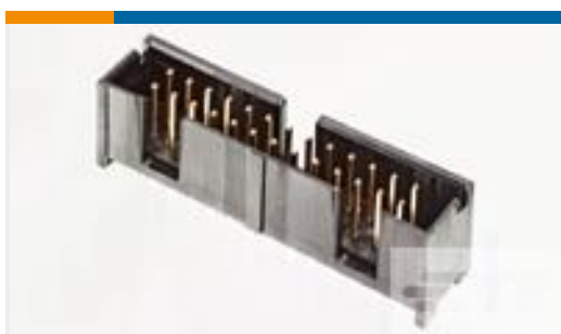
TE Part #3-1761603-7 IDC LOW PRO HDR 64P VERT BLUE