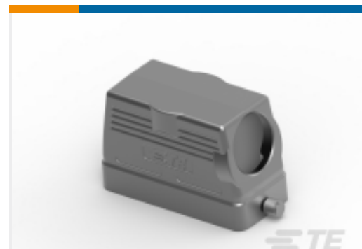
TE Part #T1310160132-000 H16B-TS-RO-M32