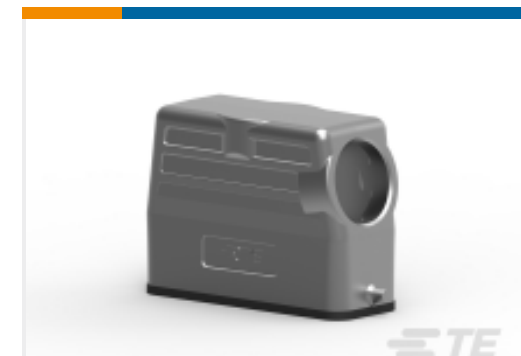
TE Part #T1319160125-000 H16A-TS-M25