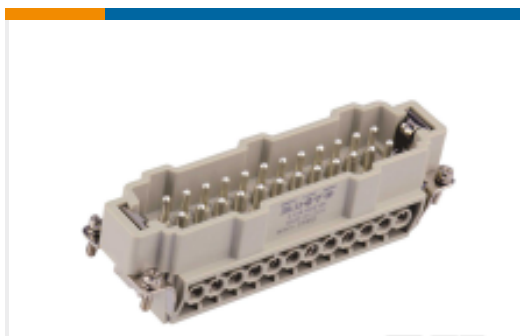
TE Part #T2040242101-000 HE-024-M