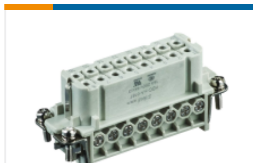
TE Part #T2010322201-000 HA-016-F 17-32