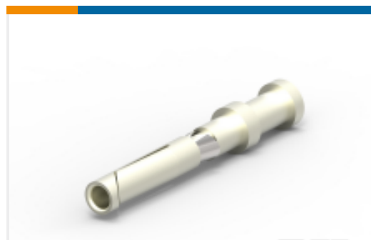
TE Part #T2020002002-000 CDF-0.3