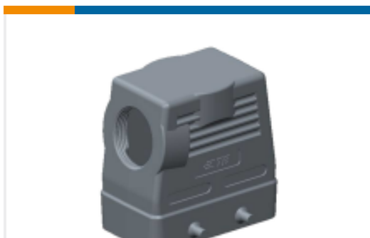
TE Part #T1230100121-000 H10B-TSH-PG21