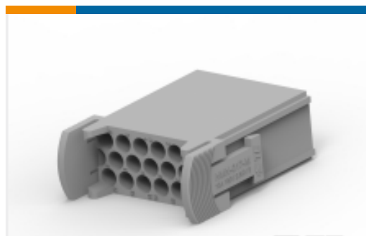
TE Part #T2111172101-000 HMN-017-M