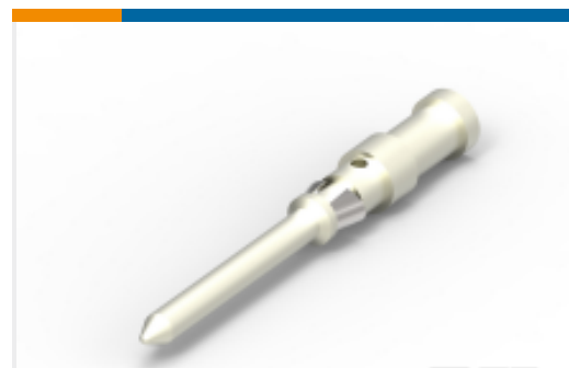
TE Part #T2020001002-000 CDM-0.3