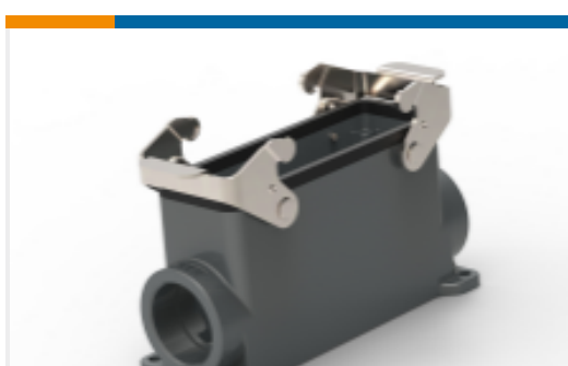
TE Part #T1470242132-000 H24B-SGRH-M32