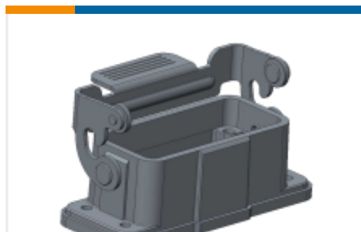
TE Part #T1509101000-000 H10A-AGS