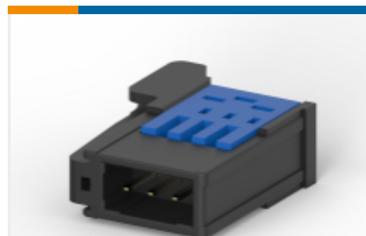
TE Part #2-2295044-3 RITS CONN. PLUG ASSY 3P BLUE TIN