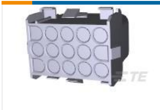
TE Part #1-480711-9 15P UMNL CAP HSG BLK