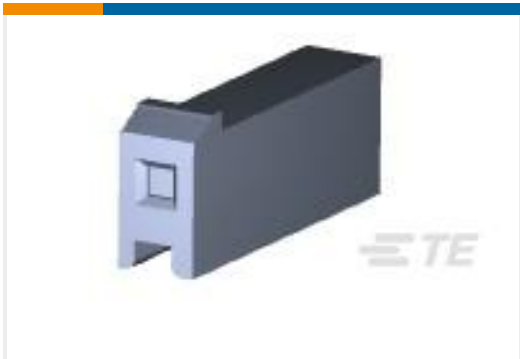
TE Part #640250-1 01P SL156 HSG W/LCK RAMP NATL