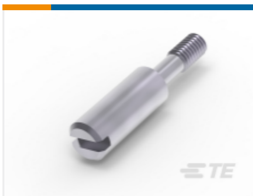
TE Part #T0931003003-000 CODING-PIN-M3