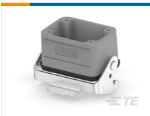
TE Part #T1730060000-000 H6B-TBF-T