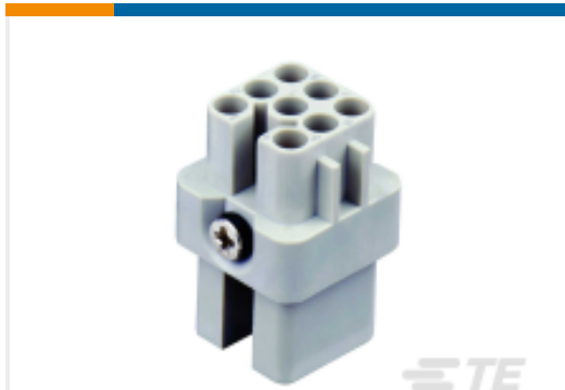
TE Part #T2020082201-000 HD-008-F