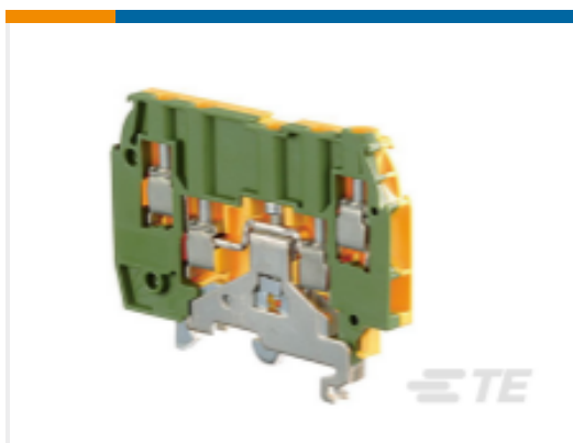
TE Part #1SNA195638R2300 M4/6.4A.P