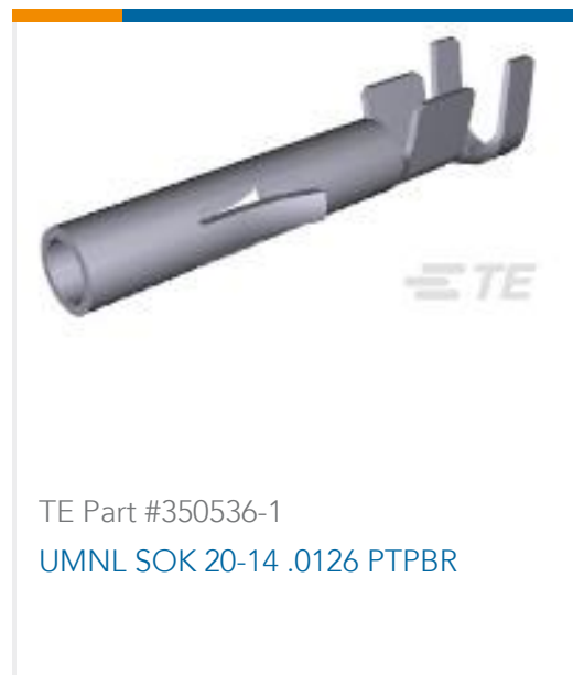
TE Part #350536-1 UMNL SOK 20-14 .0126 PTPBR