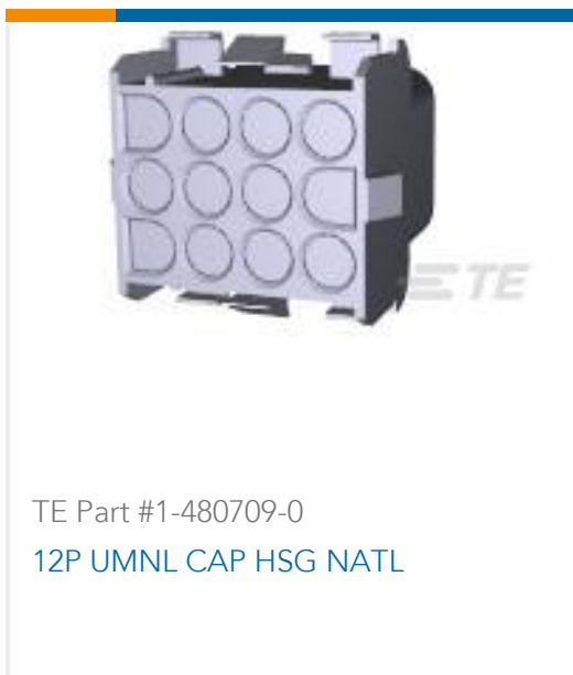
TE Part #1-480709-0 12P UMNL CAP HSG NATL