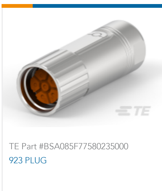
TE Part #BSA085F77580235000 923 PLUG