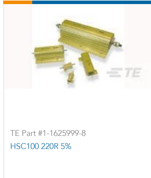
TE Part #1-1625999-8 HSC100 220R 5%