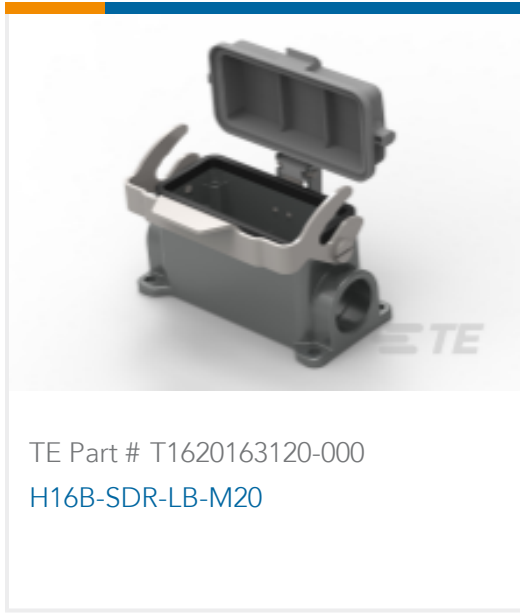
TE Part # T1620163120-000 H16B-SDR-LB-M20