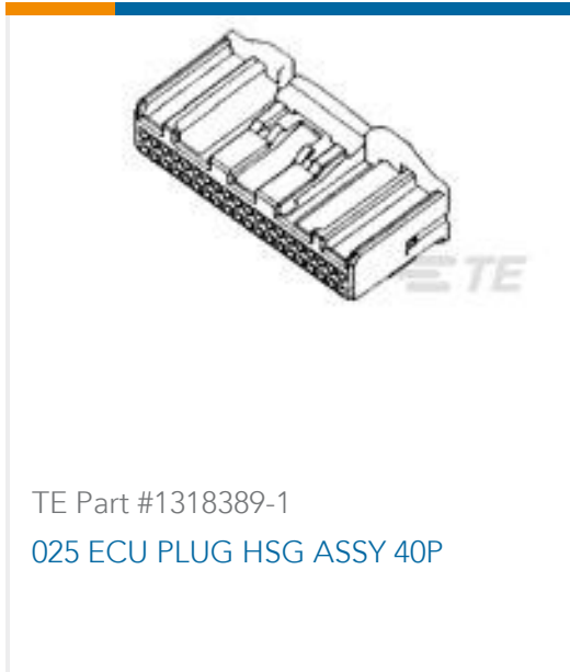
TE Part #1318389-1 025 ECU PLUG HSG ASSY 40P