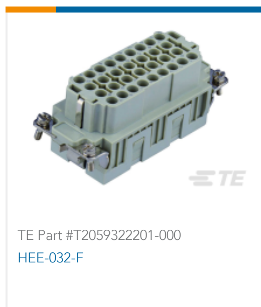
TE Part #T2059322201-000 HEE-032-F