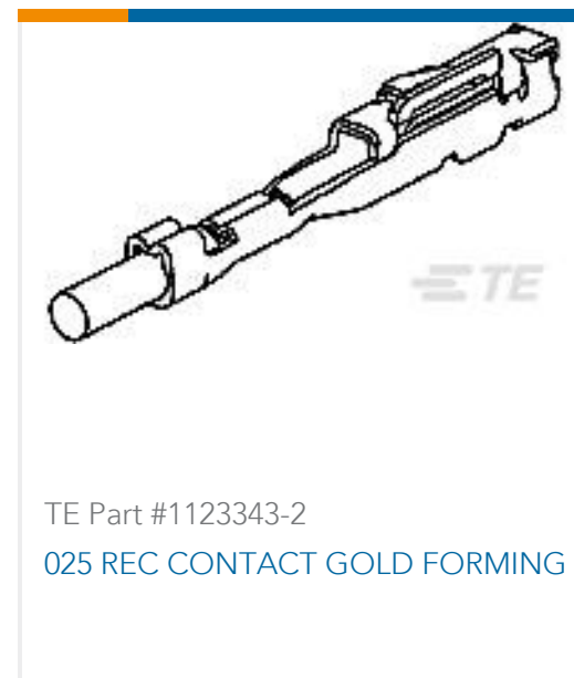
TE Part #1123343-2 025 REC CONTACT GOLD FORMING