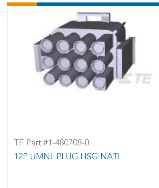
TE Part #1-480708-0 12P UMNL PLUG HSG NATL