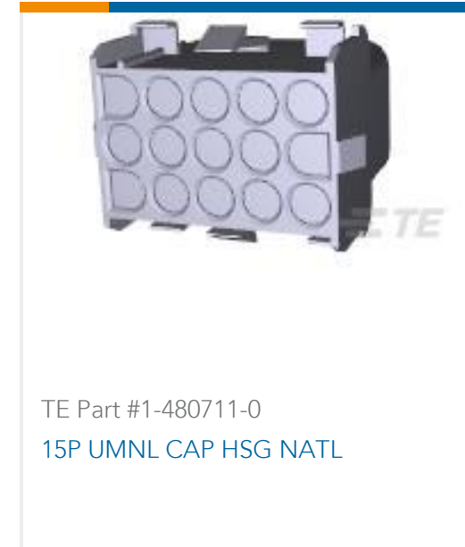
TE Part #1-480711-0 15P UMNL CAP HSG NATL