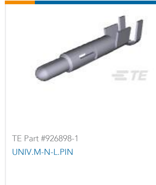
TE Part #926898-1 UNIV.M-N-L.PIN