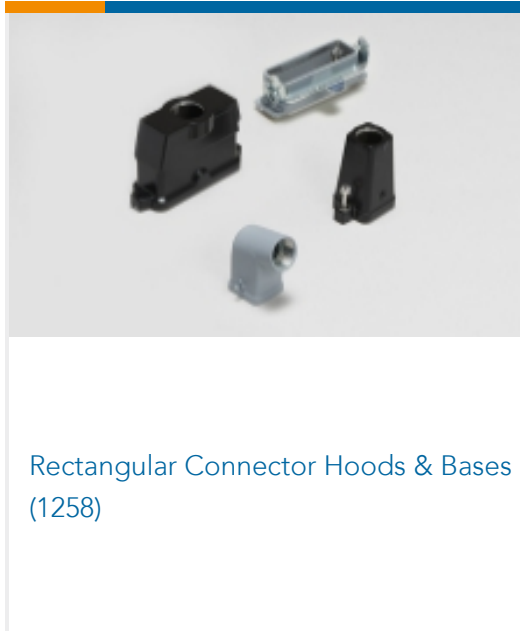
Rectangular Connector Hoods & Bases (1258)