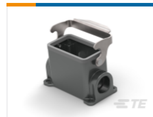
TE Part # T1610102220-000 H10B-SGRS-LB-2M20