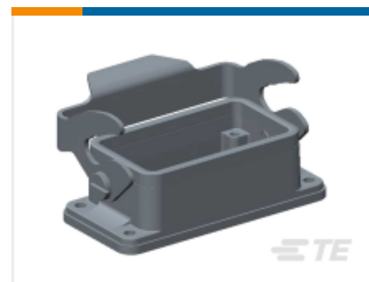
TE Part # T1500103000-000 H10B-AG-LB