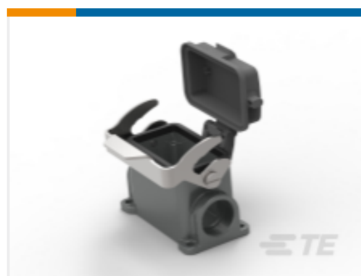
TE Part # T1620103120-000 H10B-SDR-LB-M20