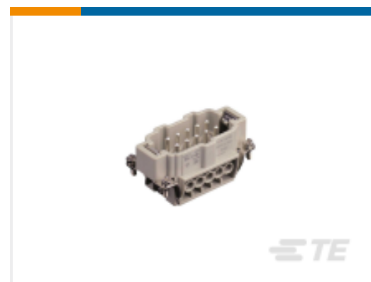
TE Part # T2040102101-000 HE-010-M