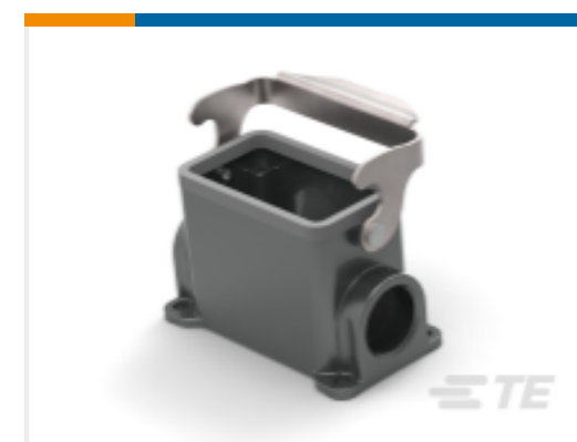
TE Part # T1610102120-000 H10B-SGRS-LB-M20