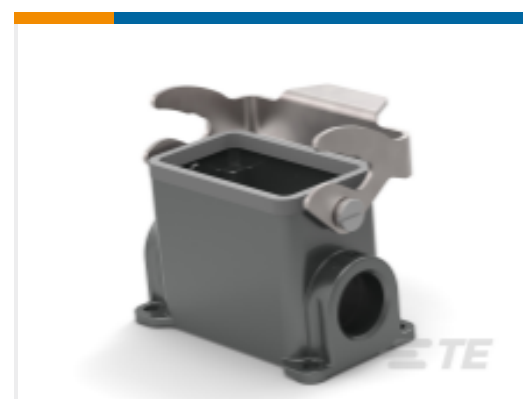
TE Part # T1610103120-000 H10B-SGR-LB-M20