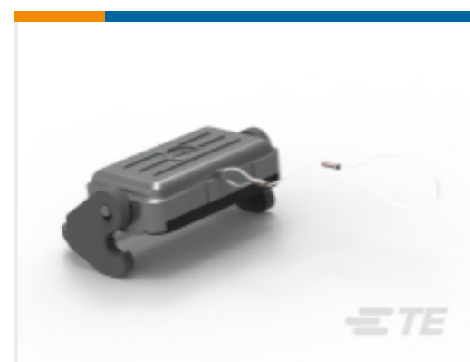
TE Part # T1010101500-000 H10B-KDTP-LB