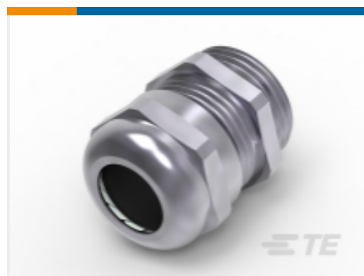
TE Part # T3609200102-000 DLX-20-M