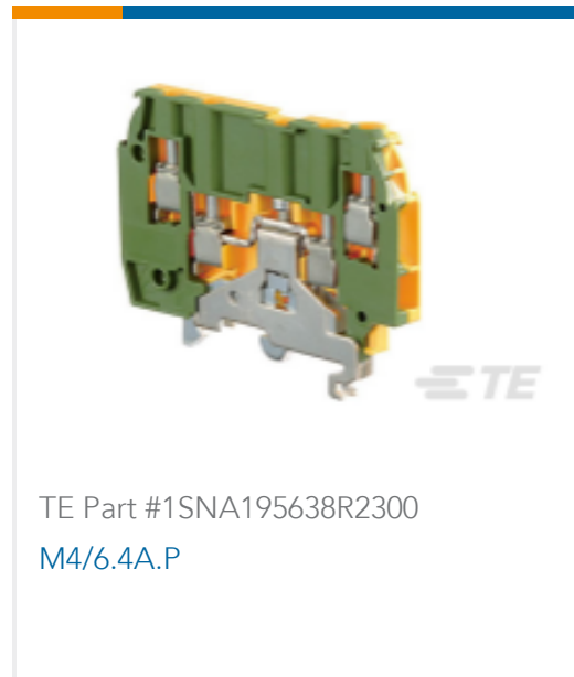
TE Part #1SNA195638R2300 M4/6.4A.P