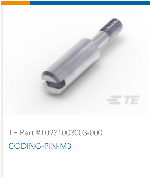
TE Part #T0931003003-000 CODING-PIN-M3