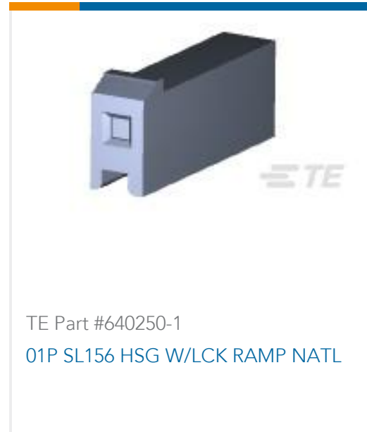
TE Part #640250-1 01P SL156 HSG W/LCK RAMP NATL