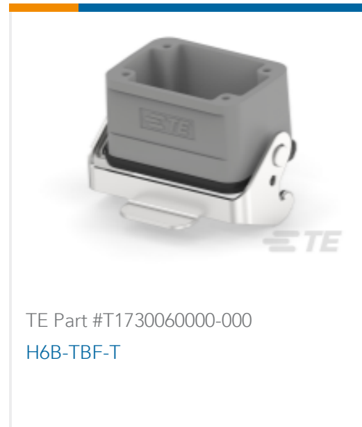
TE Part #T1730060000-000 H6B-TBF-T