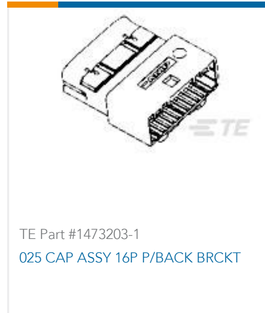
TE Part #1473203-1 025 CAP ASSY 16P P/BACK BRCKT