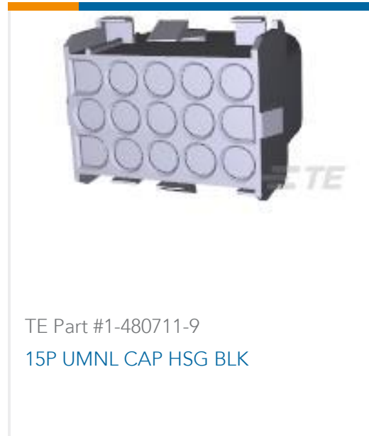
TE Part #1-480711-9 15P UMNL CAP HSG BLK