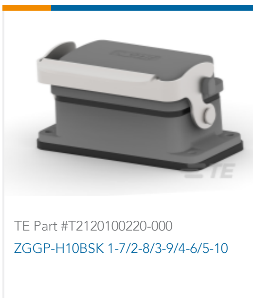
TE Part #T2120100220-000 ZGGP-H10BSK 1-7/2-8/3-9/4-6/5-10