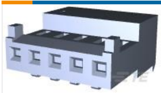
TE Part #3-644020-5 05P MTA100 CONN ASSY 30AU