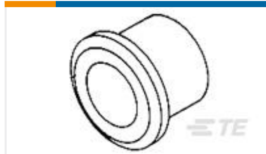
TE Part #2-350378-1 MR SPLT GROMET .218 DIA BLK LF