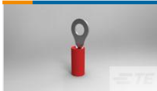
TE Part #31888 PIDG R 22-16 COMM 22-18 MIL 8