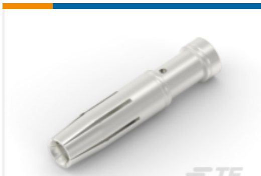
TE Part #T2030002030-000 CEF-3.0