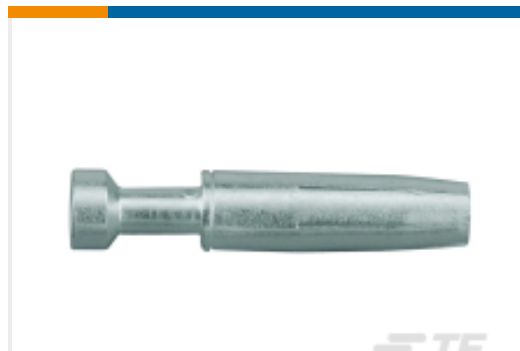
TE Part #T2030002040-000 CEF-4.0