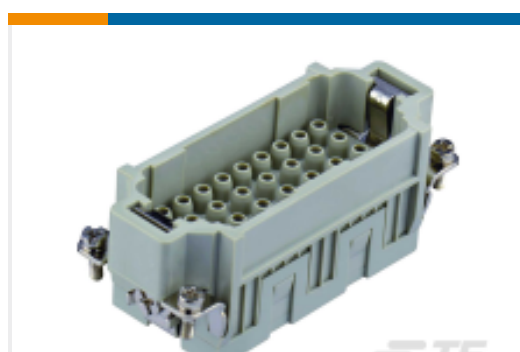
TE Part #T2050322101-000 HEE-032-M