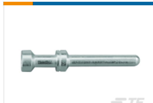
TE Part #T2030001005-000 CEM-0.5