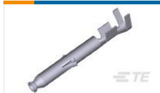
TE Part #770986-3 MINI UMNL SOK 26-22AWG AU LP