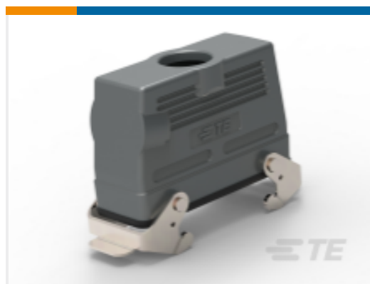
TE Part #T1750242140-000 H24B-TBFH-M40