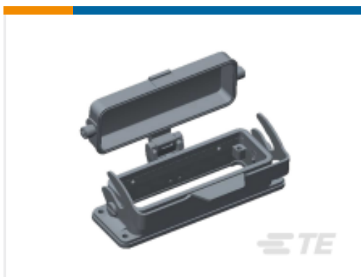
TE Part #T1510243100-000 H24B-ADM-LB