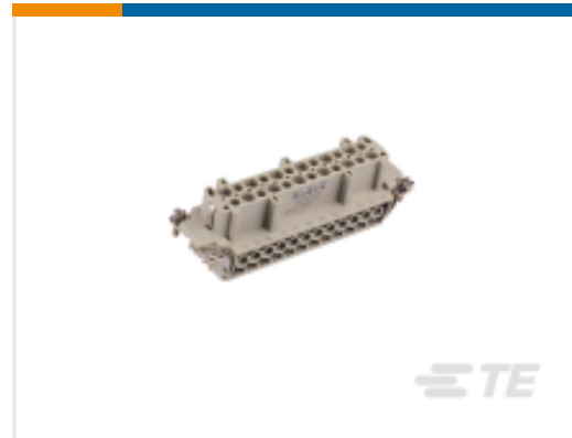
TE Part #T2040242201-000 HE-024-F