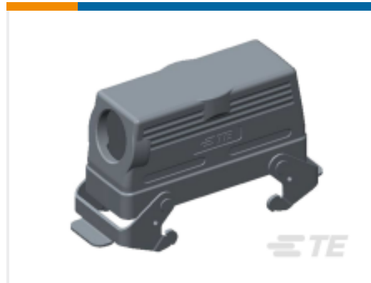
TE Part #T1250242121-000 H24B-TSB-PG21