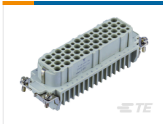
TE Part #T2020642201-000 HD-064-F