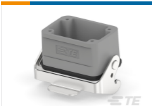
TE Part #T1730060000-000 H6B-TBF-T