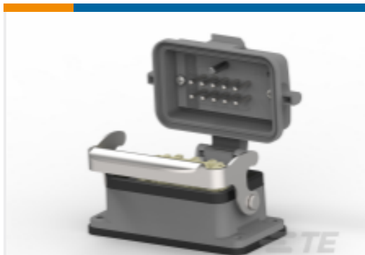
TE Part #T2120100219-000 ZGG-10DSTK,1-7,2-8,3-9,4-6,5-10